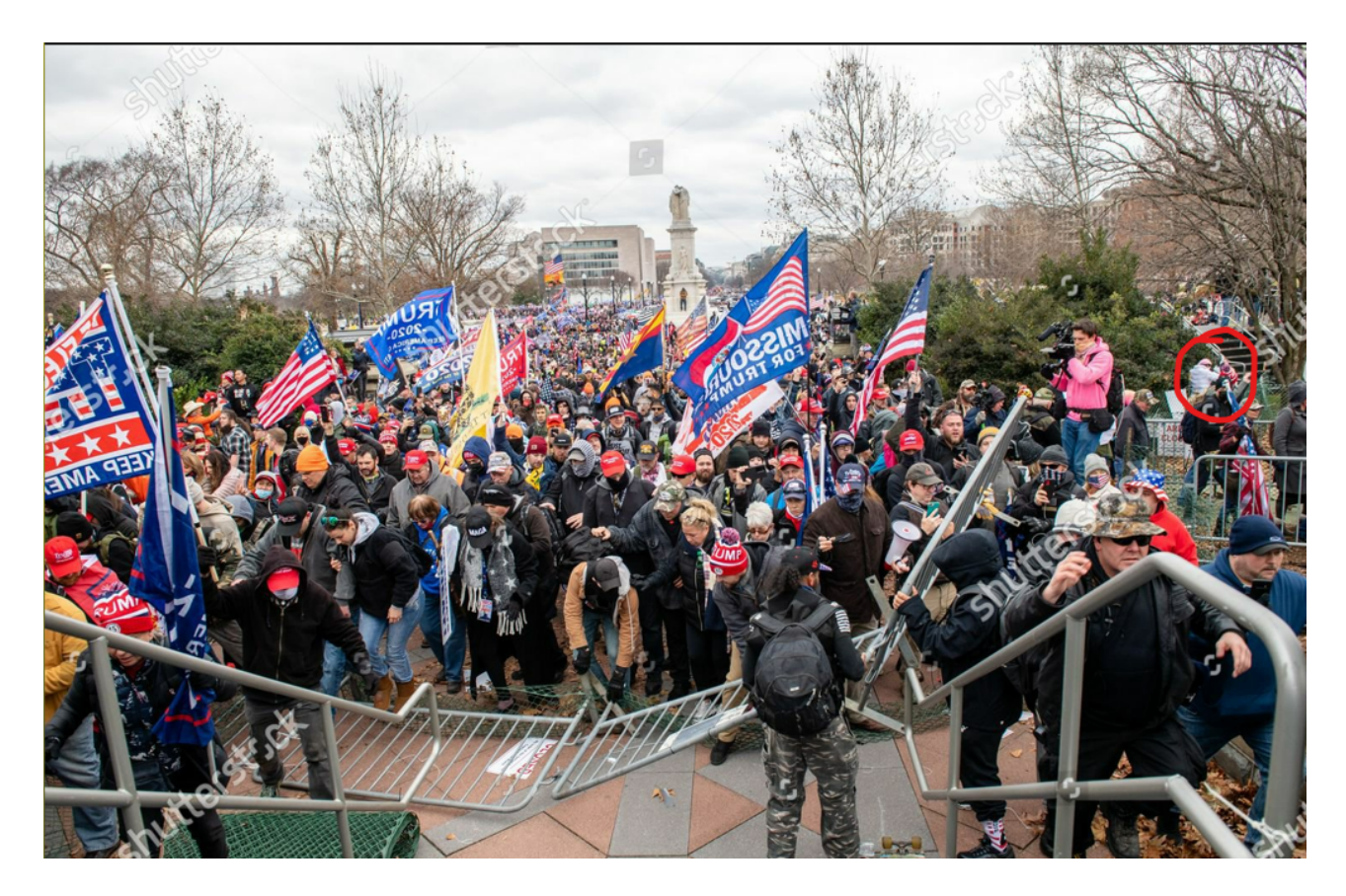
Figure 4 below shows the first breach again but at a slightly different angle. This time Pink Beret is working her way around the side fencing. She appears to be alone. Figure 5 below shows her sprinting towards the Capitol on the lawn once the barricades are down.