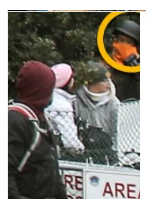
Fig. 3 is an enlargement of the area in that photo showing Pink Beret.

Fig. 2 shows scene at first breach of barricades at the Peace Circle.