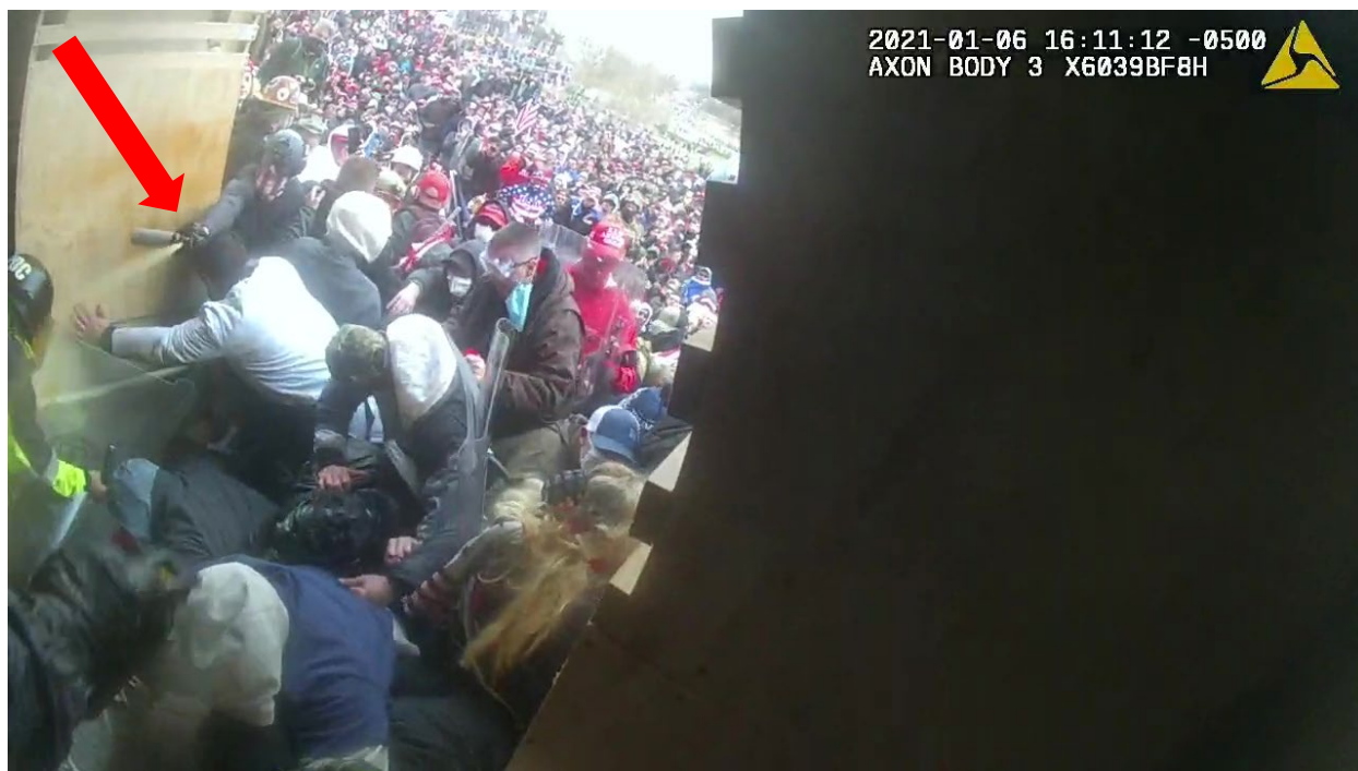
Still from Exhibit 5 – Dempsey spraying Detective Nguyen.

At approximately 4:11 p.m., Dempsey sprayed pepper spray into the tunnel, striking MPD Detective Phuson Nguyen in the face and upper-body.