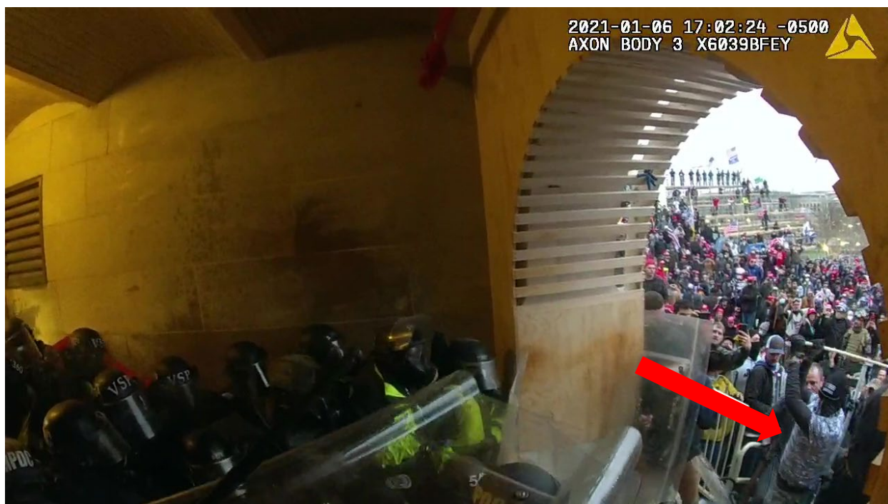
Still from Exhibit 8 – Dempsey swinging pole.

At approximately 5:02 p.m., Dempsey returned to the front line and swung a flagpole at the line of officers in the tunnel, striking an officer's riot shield.