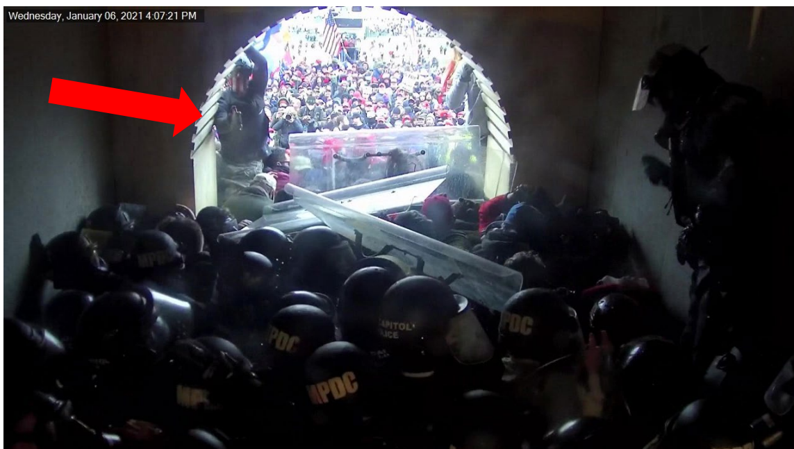
Still from Exhibit 4 – Dempsey spraying officers.

At approximately 4:07 p.m., Dempsey sprayed two separate bursts of pepper spray into the line of officers.