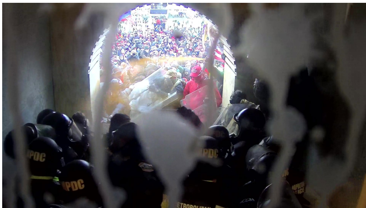
View from CCTV camera after being splashed by liquid in green bottle thrown by Dempsey.