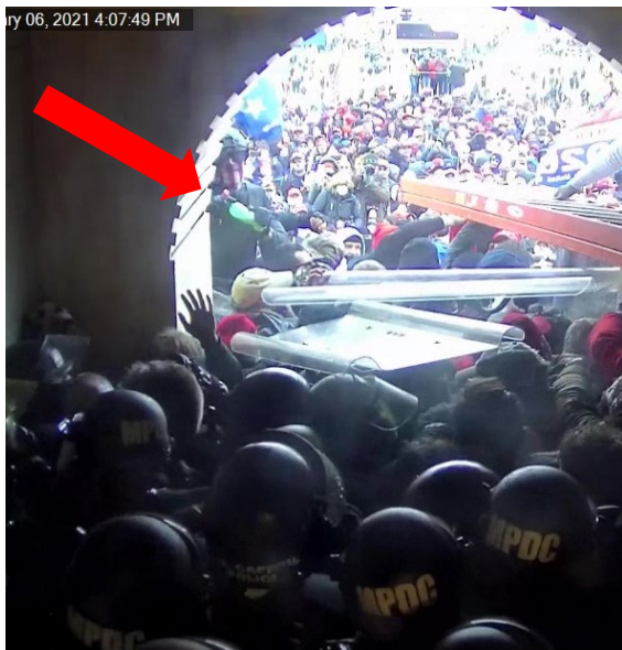
Dempsey with green bottle

At approximately 4:07 p.m., a green plastic soda bottle containing an unknown milky substance, which another rioter threw towards the tunnel, landed near Dempsey. Dempsey picked up the bottle, removed the lid, and threw it at the officers in the tunnel. The liquid hit the officers in the tunnel, and notably, splashed onto a CCTV camera. That obscured the recording of the events in the tunnel, and hampered the government's investigation of the events at the tunnel.