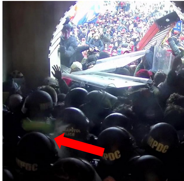
Green bottle hitting an officer's helmet