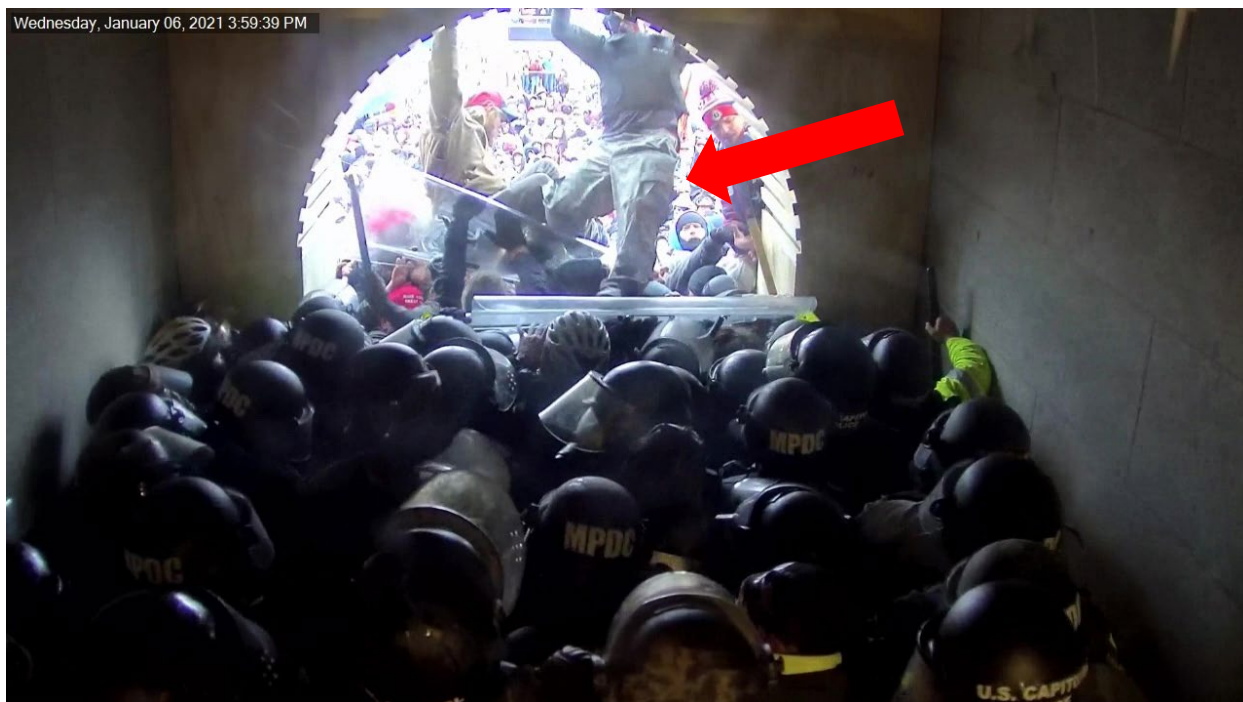
Still from Exhibit 4– Dempsey stomping on officers.

At approximately 4:01 p.m., Dempsey took a long pole from the crowd. At approximately 4:02 p.m., Dempsey swung the long pole at the officers in tunnel, striking their riot shields.