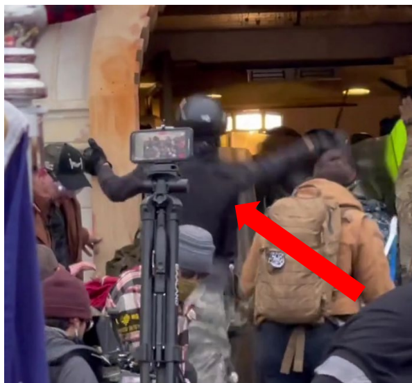
Dempsey throwing two objects at officers.