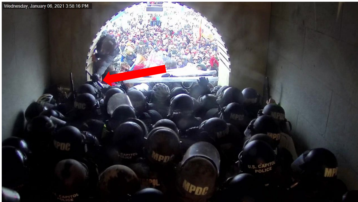
Still from Exhibit 4 – Dempsey grabbing police baton.

At approximately 3:58 p.m., Dempsey grabbed an officer's baton and unsuccessfully tried to pull it away from the officer.