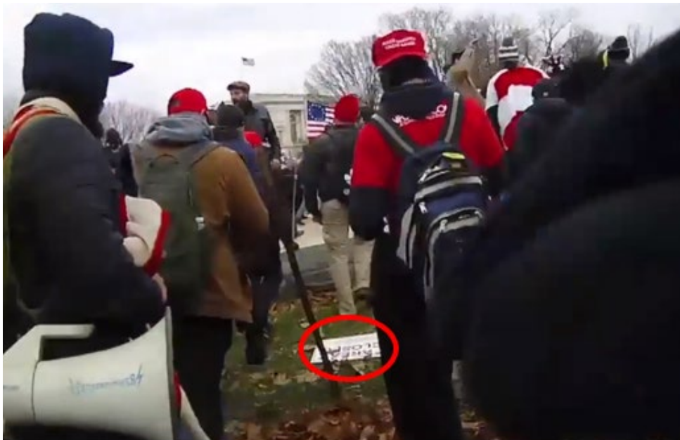
Stillshot from Exhibit 11, at 10:01 minutes