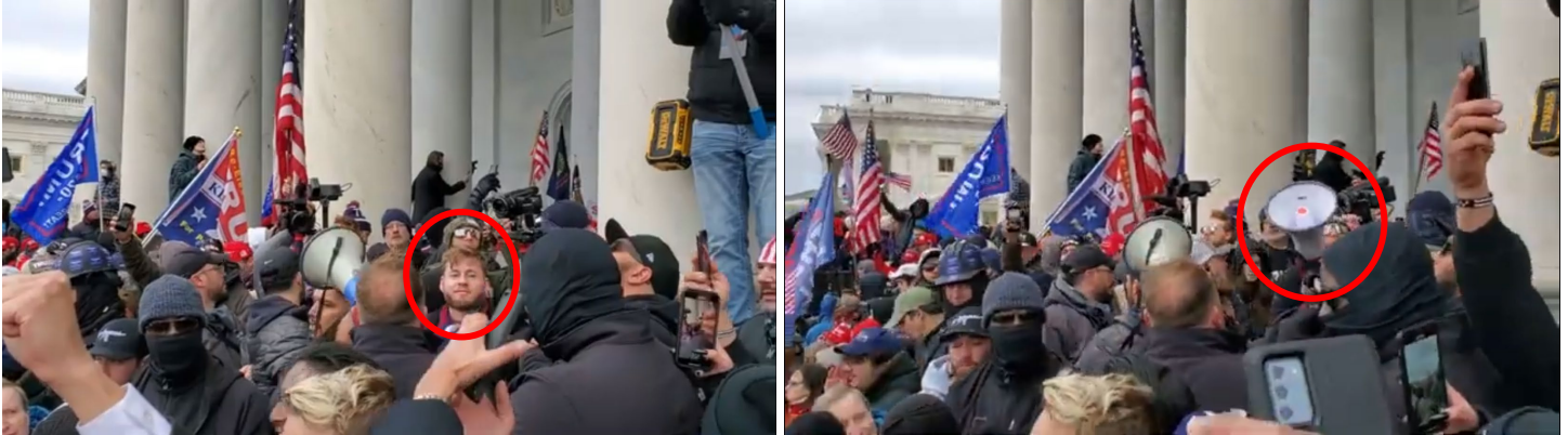
Stillshots from Exhibit 12, at 33:38 and 33:41 minutes