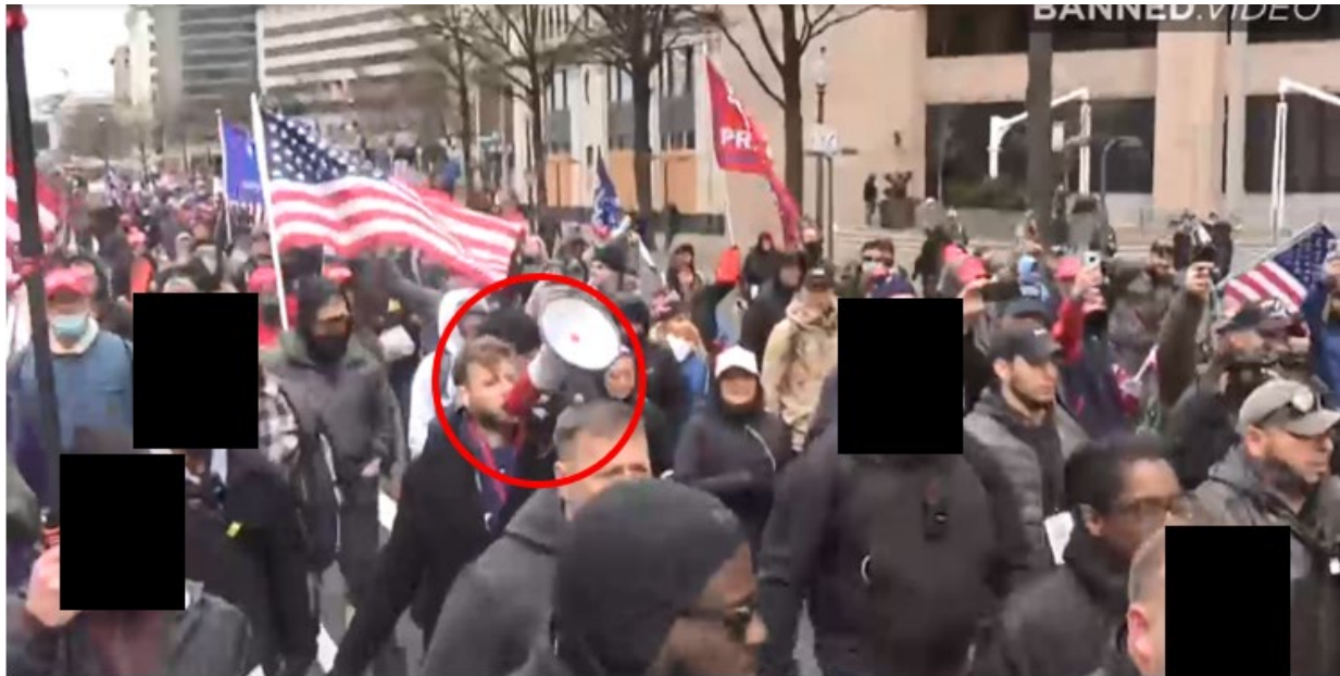
Stillshot from Exhibit 9, at 15:12 minutes