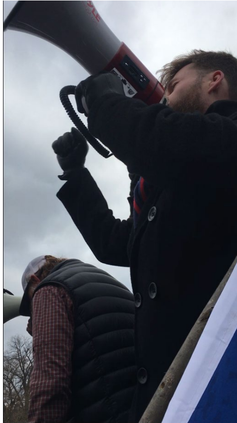
Stillshot from Exhibit 10, at 00:23 minutes

and led a crowd of hundreds of individuals on the Capitol grounds in chants of “USA! USA! USA!” 4 Exhibit 10, Parler Video West Front, at 00:22 minutes.