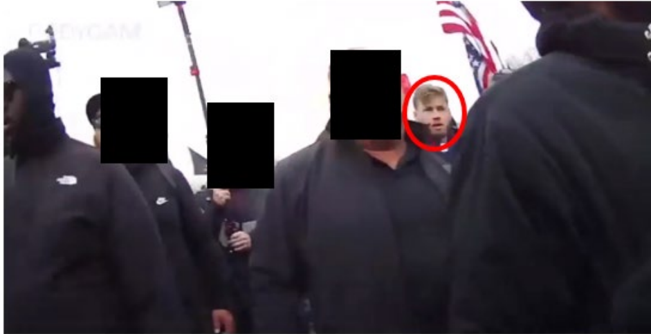
Stillshot from Exhibit 11, at 11:08 minutes

Once on the east side of the Capitol building, the body-camera individual again attempted to speak to police officers guarding the perimeter of the Capitol Building to get Person One on the Capitol Building steps. After several attempts, and no positive responses from police to this request, the group decided to “just get him up there, just do it, but we know we might catch a bang or two.” Exhibit 11, Body Guard Body Cam, at 17:50 minutes.