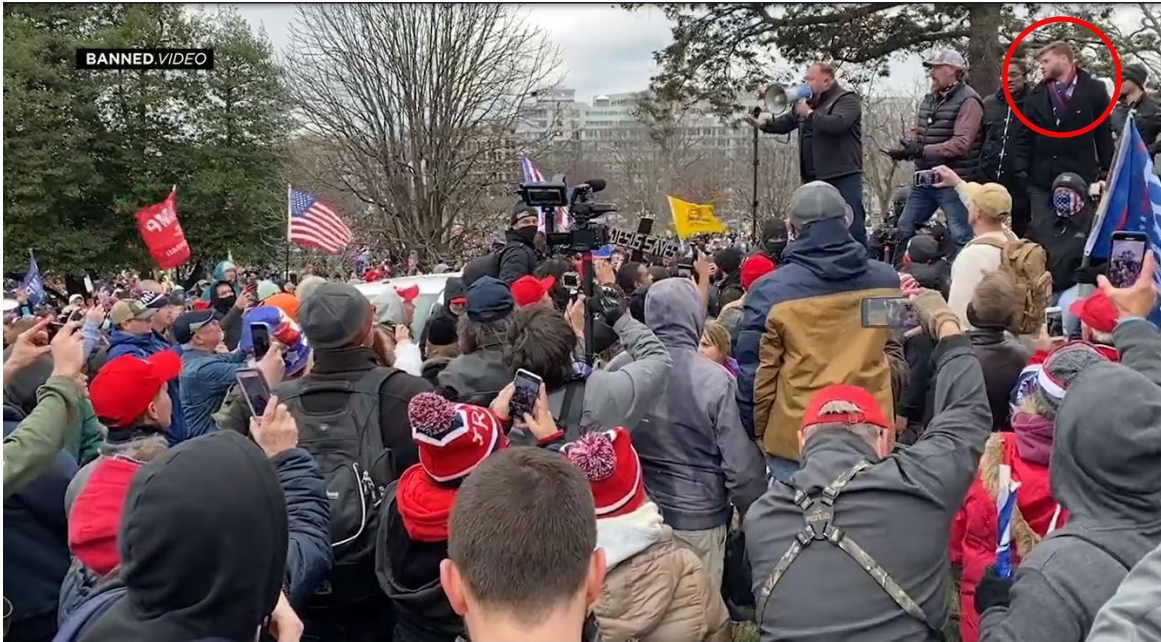
VIDEO: Alex Jones Tried To Stop Storming of DC Capitol