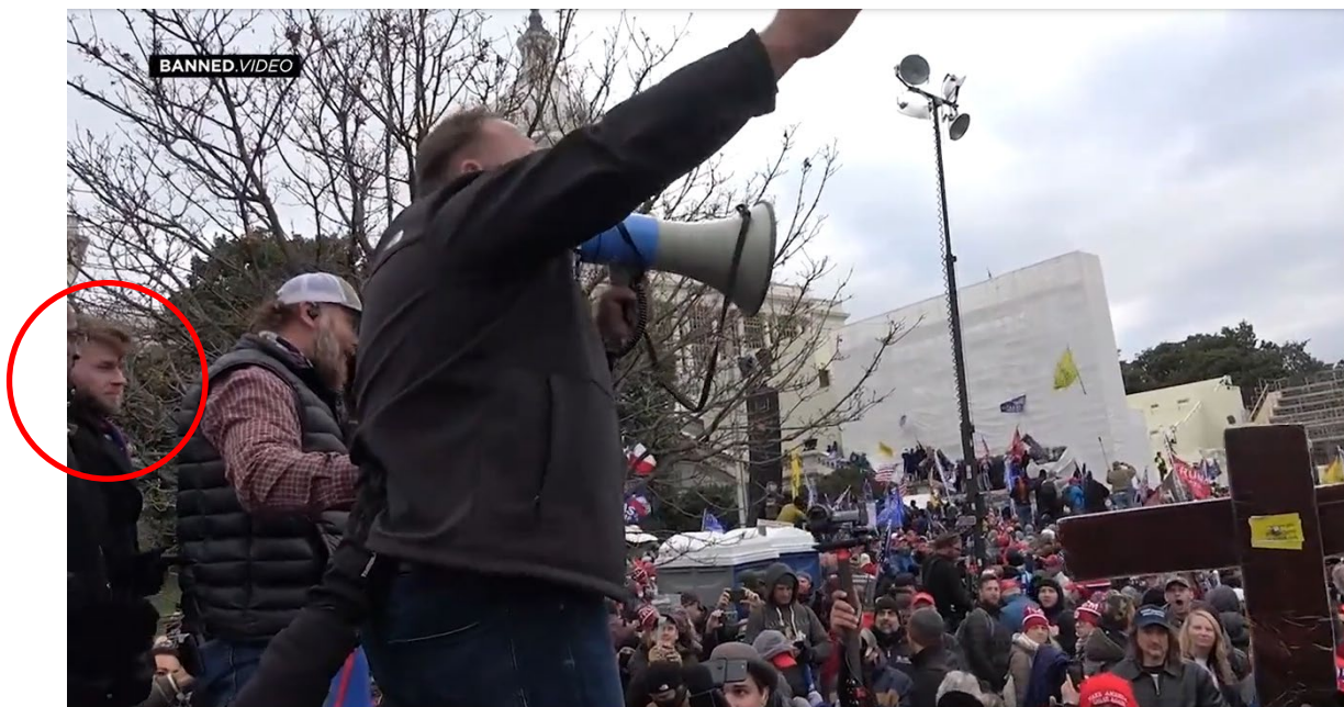
VIDEO: Alex Jones Tried To Stop Storming of DC Capitol