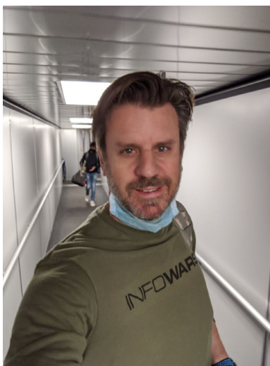
(Picture posted by “JB” in Telegram Group “The California Patriots- DC Brigade”)

One of the members of this chat was Telegram user “JB” (UID XXXXXX1832). On January 5, 2021, at approximately 6:30 a.m. PST, Telegram user “JB” posted a picture of himself with the caption “Boarding LAX.” LAX is the airport code for the Los Angeles International Airport.