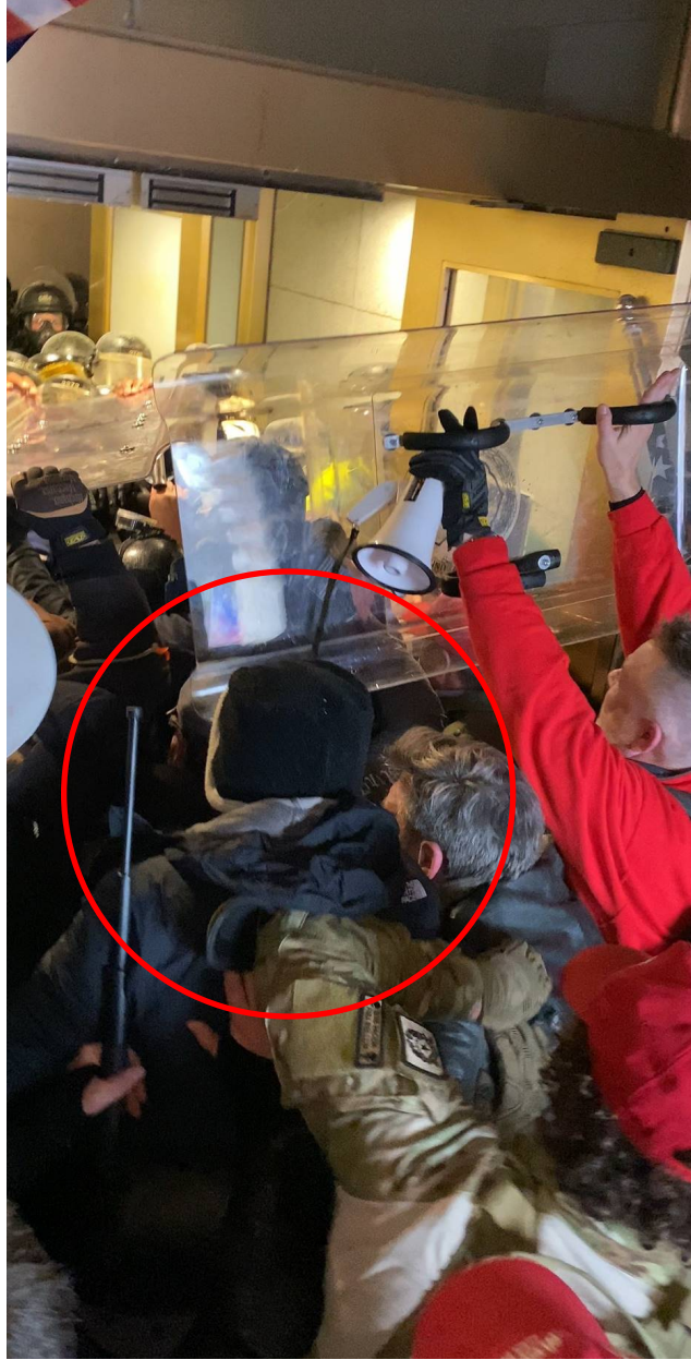
(BROWN at the front of the crowd of rioters participating in the pushing action against officers)