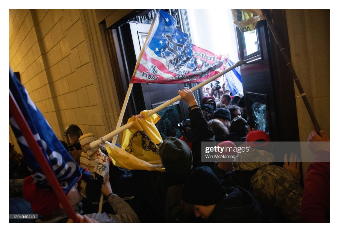
Figure 6: Open-source photograph of the breach of the East Rotunda Doors.

Once the doors had been breached, and as the alarms continued to blare, hundreds of rioters poured into the building and past USCP officers, who were pinned against the door.