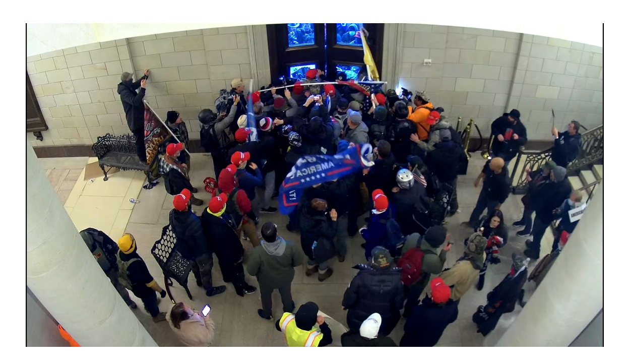
Figure 5: Screenshot from Exhibit 3, showing officers being crushed as rioters force open the East Rotunda Doors. Buhler and Hardin, who are not visible in this photograph, were standing just behind the pillar on the left.