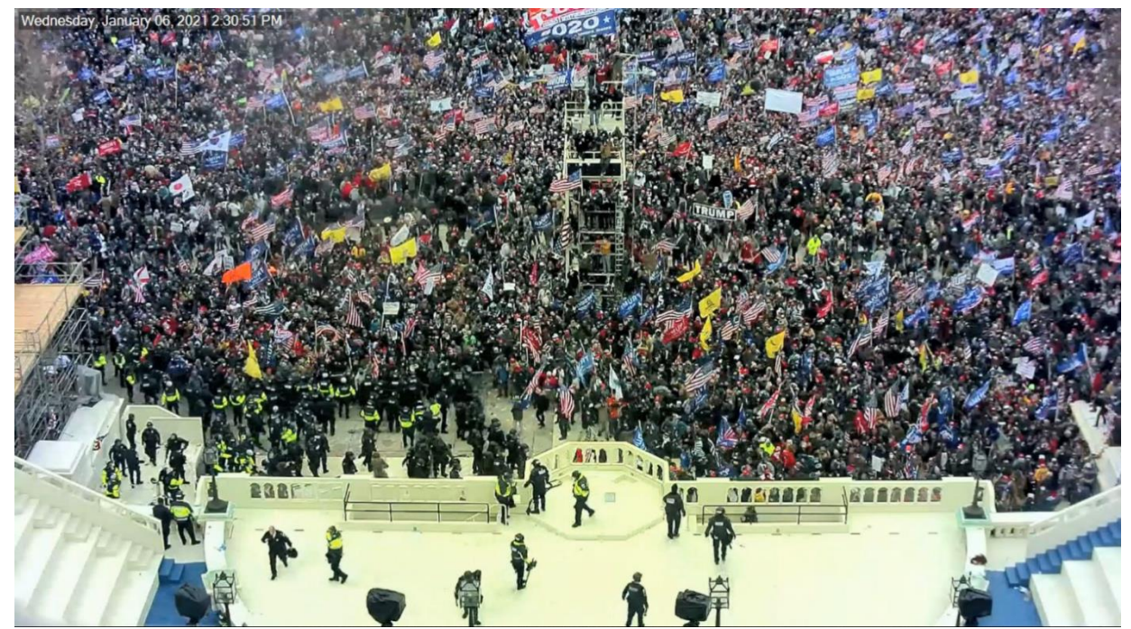
With that backdrop we turn to Laurens's conduct and behavior on January 6.