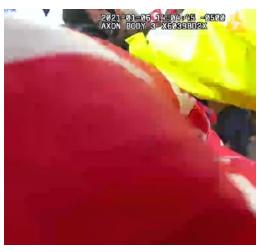
Government Exhibit 307 at 1:00:48 (2:04:45 p.m.) View from Officer Parker's BWC as Perkins strikes his chest with a flagpole