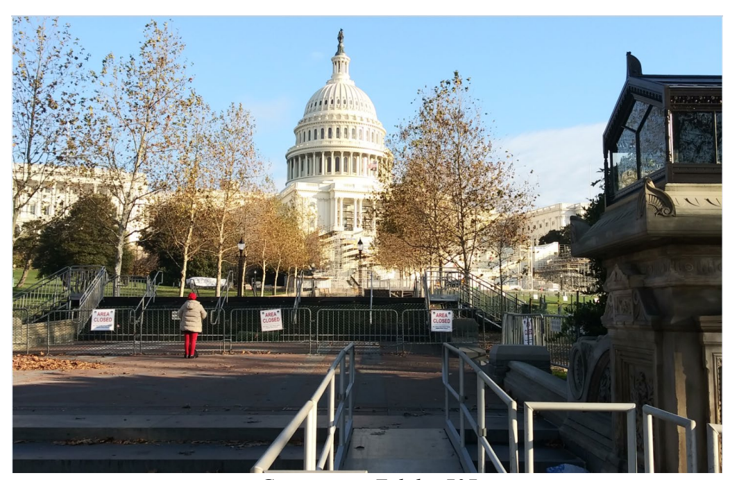
Government Exhibit 737 Photograph found on Perkins's cellphone of bike rack barricades and "Area Closed" signs, taken on December 12, 2020

This group crossed the restricted perimeter that the U.S. Capitol Police ("USCP") and Secret Service had established around the Capitol building and portions of the Capitol grounds.<sup>3</sup> The existence of this perimeter was not news to Perkins. In fact, he had traveled to Washington, D.C. less than a month earlier, on December 12, 2020, in order to attend a protest in support of then-President Trump. At that time, Perkins photographed the same signs and fencing establishing a perimeter around the Capitol.