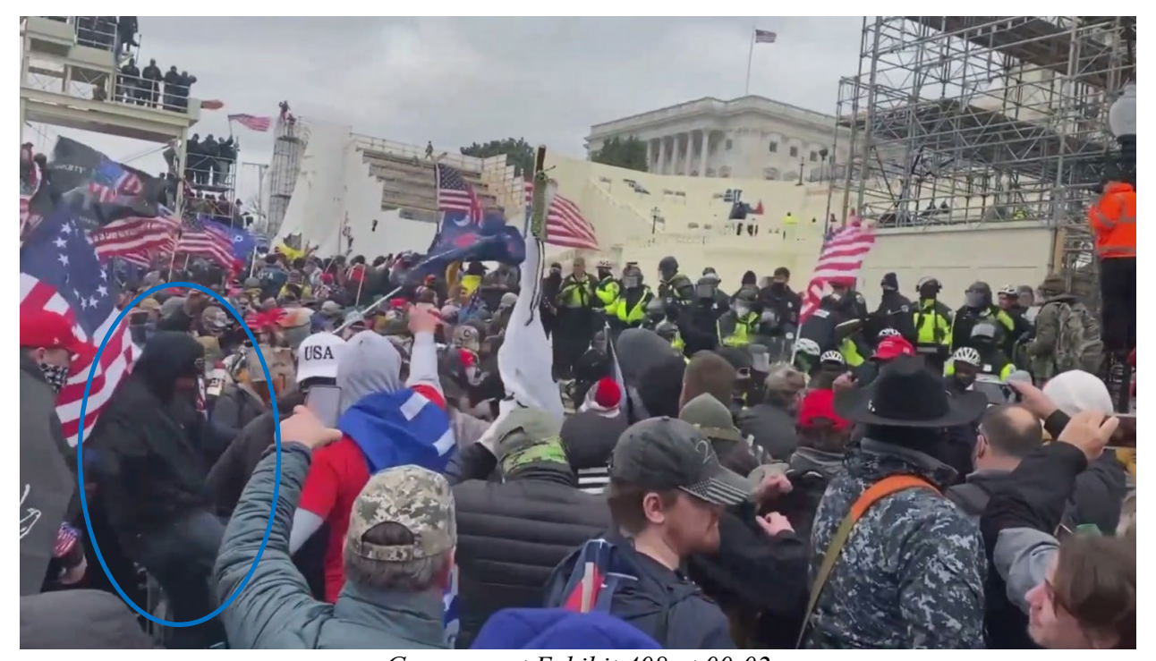
Government Exhibit 408 at 00:02 Perkins (circled in dark blue) kicks at an MPD officer lying on the ground.

Less than ten minutes later, rioters on the West Plaza began a new round of attacks on the police, and officers once again descended into the crowd to retrieve a stranded officer, who lay on the ground, surrounded by the mob. Perkins wound up and kicked at the officer, just seconds before another officer pulled him from the crowd. GX 408, 714.8.