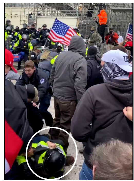
Government Exhibit 714.8 at 00:02 The MPD officer (circled in white) lying on the ground