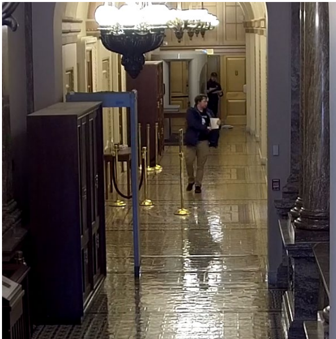
Gallery West Approximately 2:25pm Individual matching the description of VUKICH securing paperwork that he appears to have picked up from inside the U.S. Capitol.