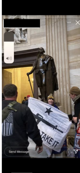
[REDACTED] Instagram Post