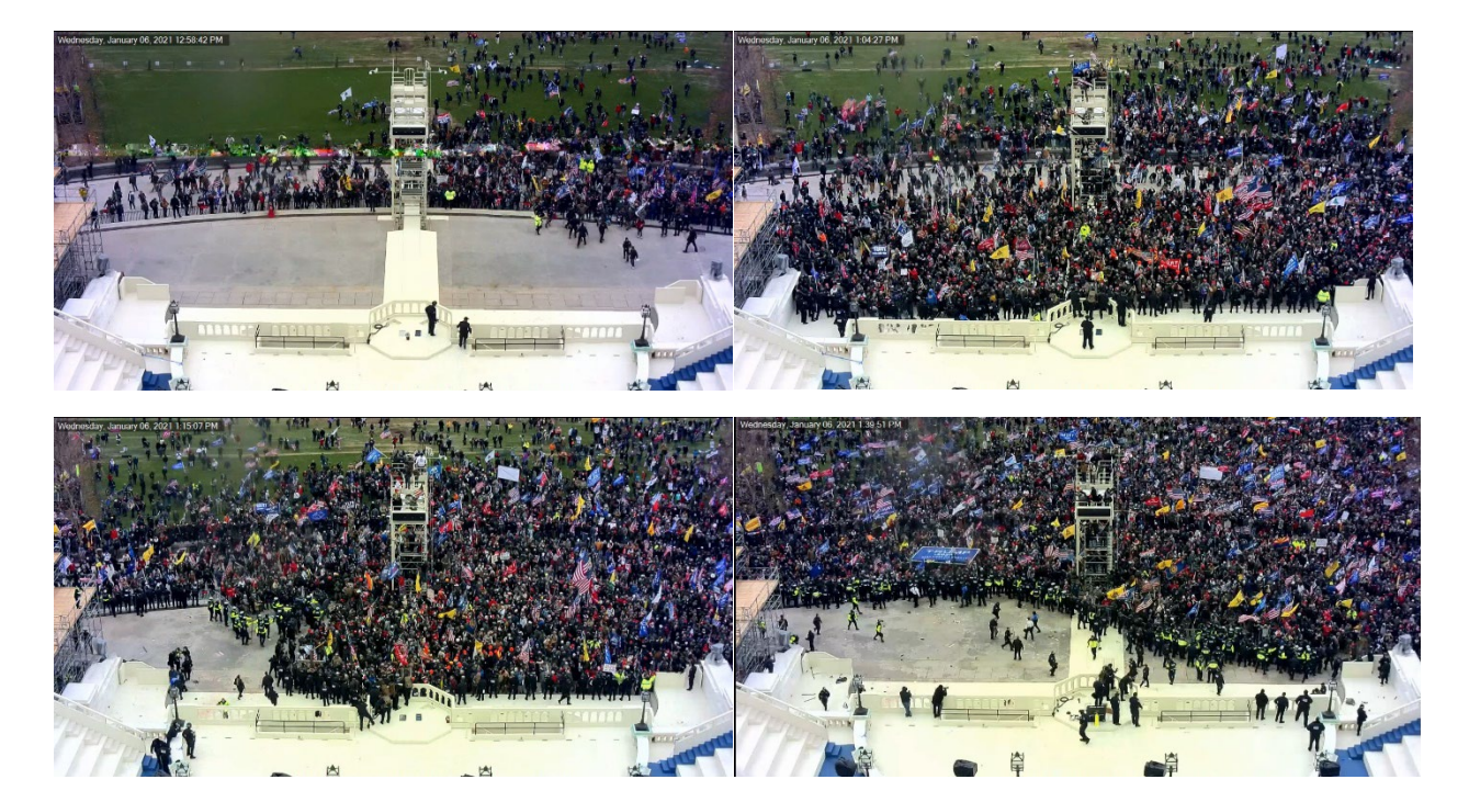
Exhibit 3: The breach of the West Plaza barricades (top left) was followed by the formation of a USCP officer wall (top right) until MPD officers arrived with bike rack barriers for a defensive line at the top of the West Plaza stairs (bottom left). In the photo of the nearly completed bicycle rack barrier line as of 1:39 p.m., a large Trump billboard which would later be used against the police line like a battering ram is visible (bottom right).

reinforcement of a police defensive line on the plaza with fists, batons, makeshift projectiles, pepper spray, pepper balls, concussion grenades, smoke bombs, and a wide assortment of weaponry brought by members of the crowd or seized from the inaugural stage construction site.