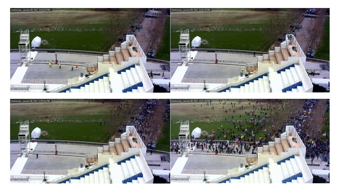
Exhibit 2: Stills from USCP security footage showing the progression of the crowd, from the outer barricades (top left), to the first manned police barricade (top right), to engaging with USCP at the second manned police barricade (bottom left), and beginning to fill the Lower West Plaza (bottom right).

area to engage with USCP officers at the first manned barrier. Less than a minute later, with the crowd already numbering in the hundreds, the handful of USCP police officers in and around the barrier were shoved out of the way by the mob. By 12:58, the rioters had crossed the unmanned barrier halfway down the Pennsylvania Walkway and overwhelmed the second manned police barrier, Area B on Government's Exhibit 1. They flooded the area labeled "Lower West Plaza" Area C on Government's Exhibit 1, pushing against the barricade there.