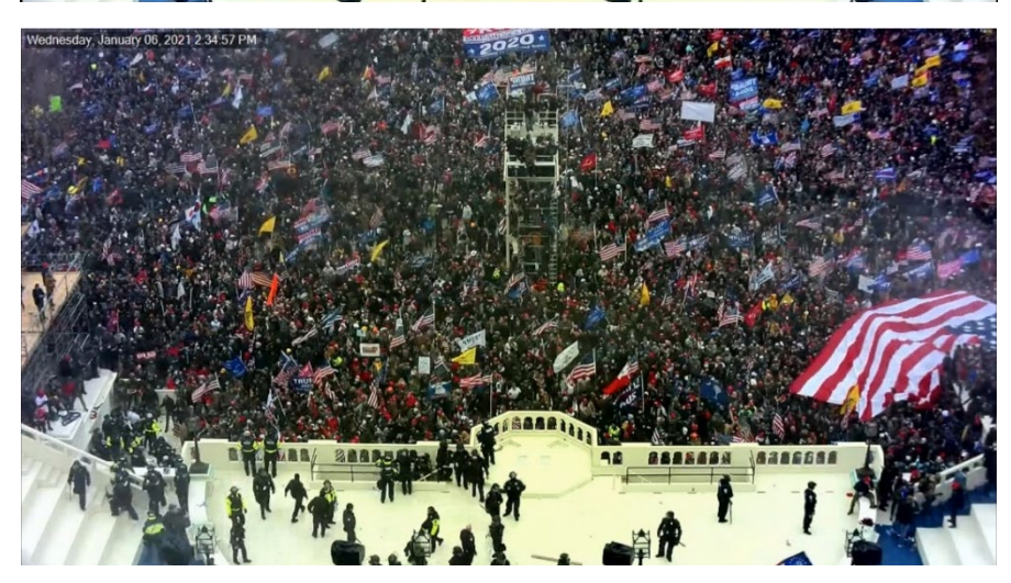
Exhibit 4: Breakthroughs in the defensive line on both the left and right flanks (top) caused the entire police line to collapse and individual officers were swallowed by the crowd (middle) and many officers were assaulted as they waited in a group to retreat through doors and stairwells up onto the inaugural stage (bottom).