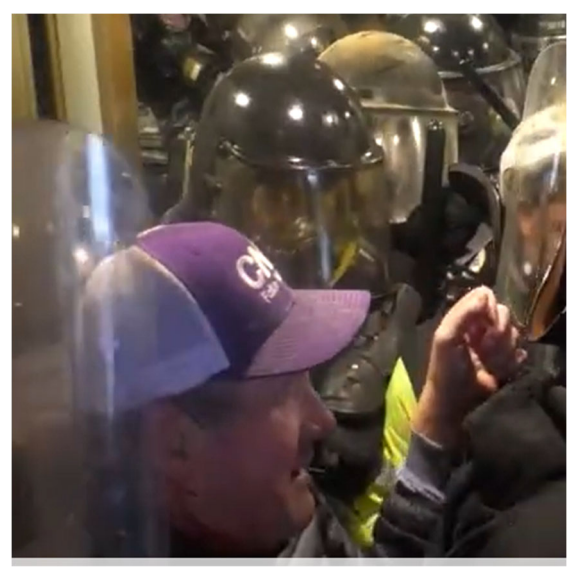
WILSON in the tunnel

The following screenshots were obtained from the recordings and depict some of the aforementioned activity: