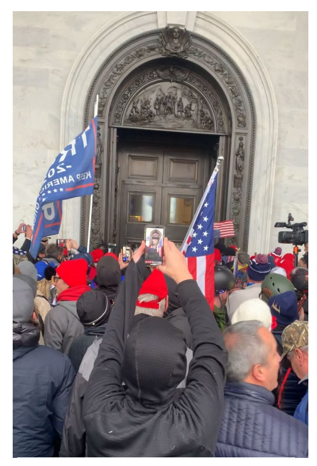
Exhibit 13A – screenshot of Exhibit 13, recorded on Revlett's cellphone at 3:09 p.m., following Revlett's exit from the Capitol building

Revlett recorded videos on his phone from the east side of the Capitol building after he exited, showing rioters standing on tactical vehicles and trying to get into the building via the East Rotunda Door.<sup>5</sup>