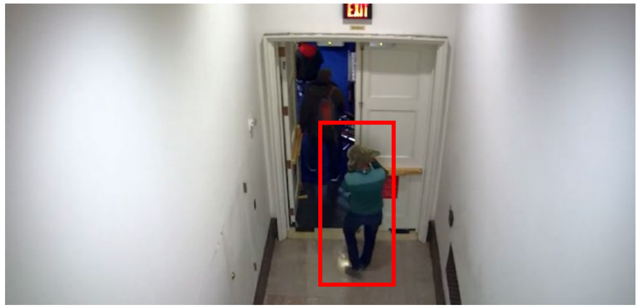
Exhibit 9 – Camera 0751 at 2:55:55 p.m. – House-side fire door, second floor (same floor as Rotunda)