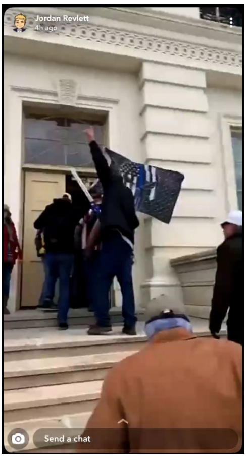
Exhibit 3C – moments later, Revlett has panned away from the group of police and is facing the Upper West Terrace Door. No police are visible in this shot.