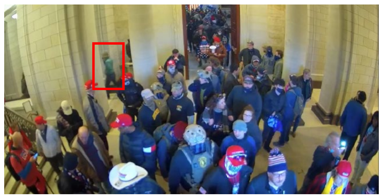
Exhibit 8 – Camera 0686 "Rotunda Door Interior" at apx. 2:55:44 p.m.

Revlett left the Rotunda around 2:54 p.m., wandering away from the crowd, appearing to explore other areas: