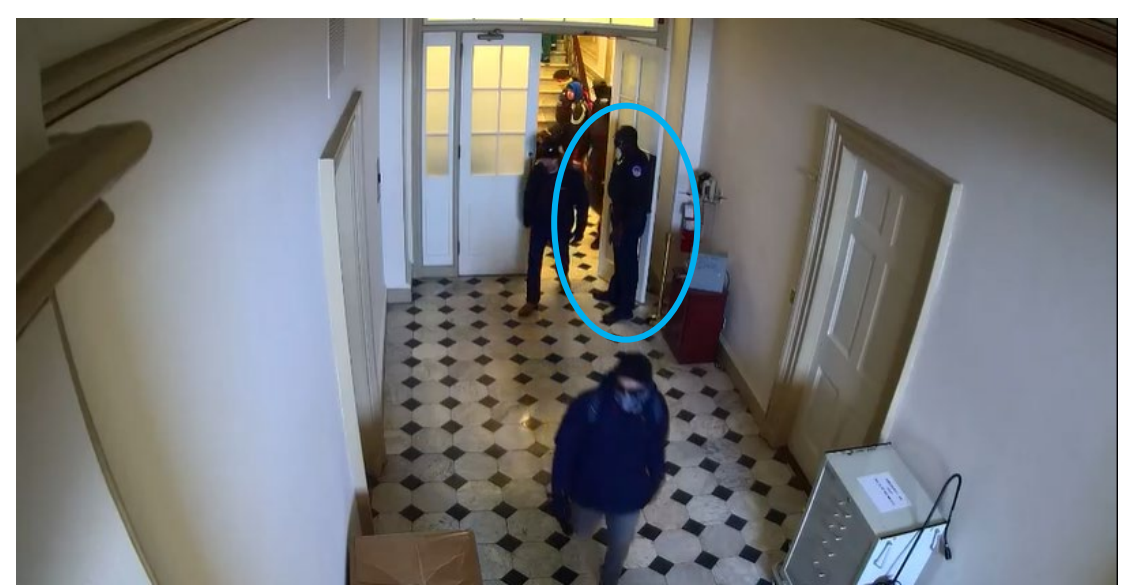
Exhibit 4A – Camera 0126 "Upper West Terrace" at apx. 2:33:40 p.m., Capitol Police officer circled in blue

Further, CCTV shows that, at approximately 2:33 p.m., Capitol Police were trying to get rioters to leave through the Upper West Terrace door: