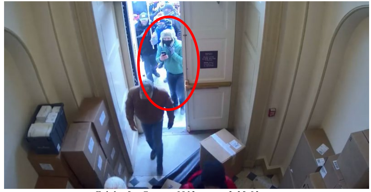
Exhibit 5 - Camera 0912 at apx. 2:35:03 p.m.

A different angle showing the Upper West Terrace Door from the inside shows no police near the door at the time when Revlett entered or at any time preceding his or other rioters' entry through that door; certainly no police are visible opening the door from the inside: