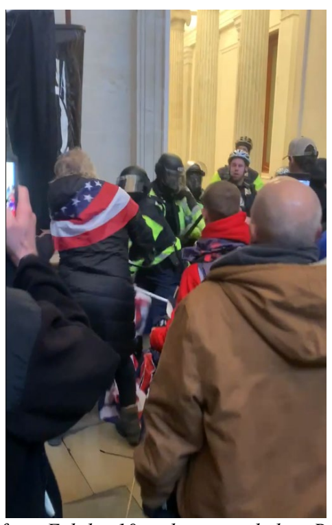
Exhibit 10A – screenshot from Exhibit 10, video recorded on Revlett's cellphone showing altercation between a rioter and a Metropolitan Police officer

Revlett returned to the Rotunda around 2:56 p.m. While in the Rotunda, Revlett filmed a rioter shoving police, and vis-versa. Rioters can be heard shouting expletives at police in that video.<sup>4</sup>