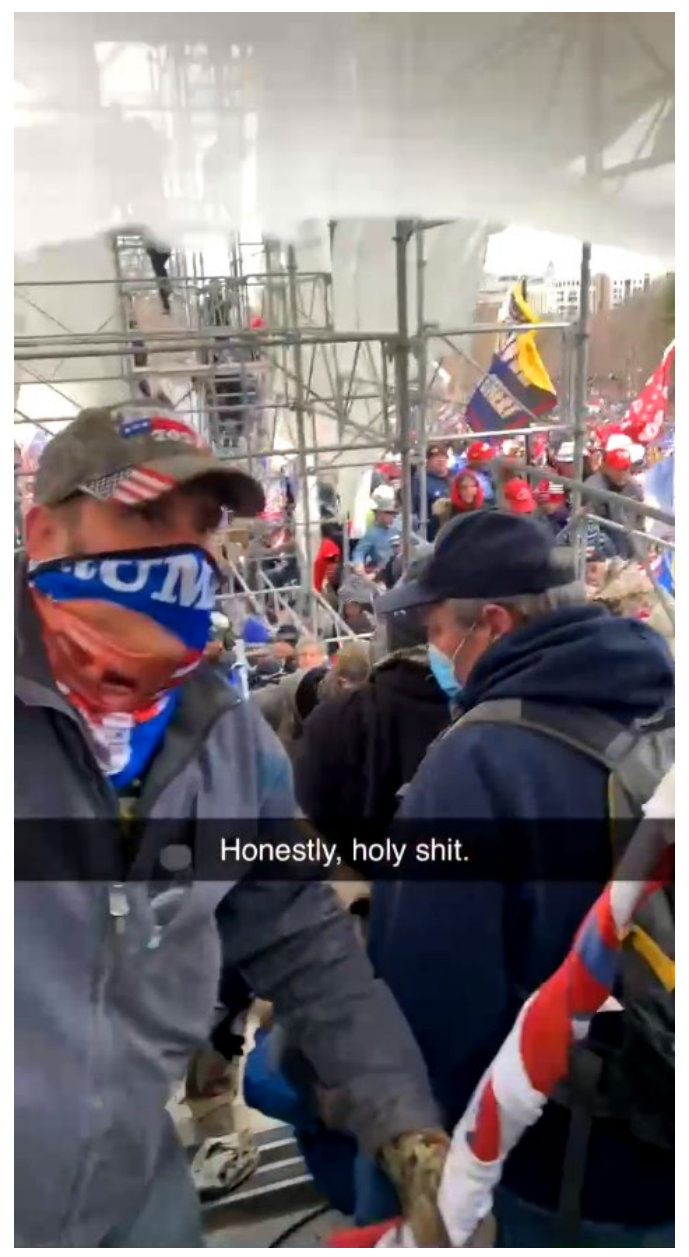
Exhibit 1A (left) – Screenshot from Exhibit 1 showing NW Scaffolding and crowd of rioters;