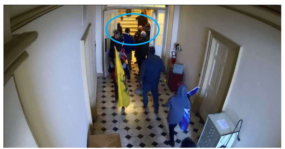
Exhibit 4B – Camera 0126 "Upper West Terrace" at apx. 2:34:43 p.m., Capitol Police officers circled in blue

As rioters exited that exterior door, however, more rioters began to pour in. Capitol Police briefly tried to block those individuals from progressing further into the building: