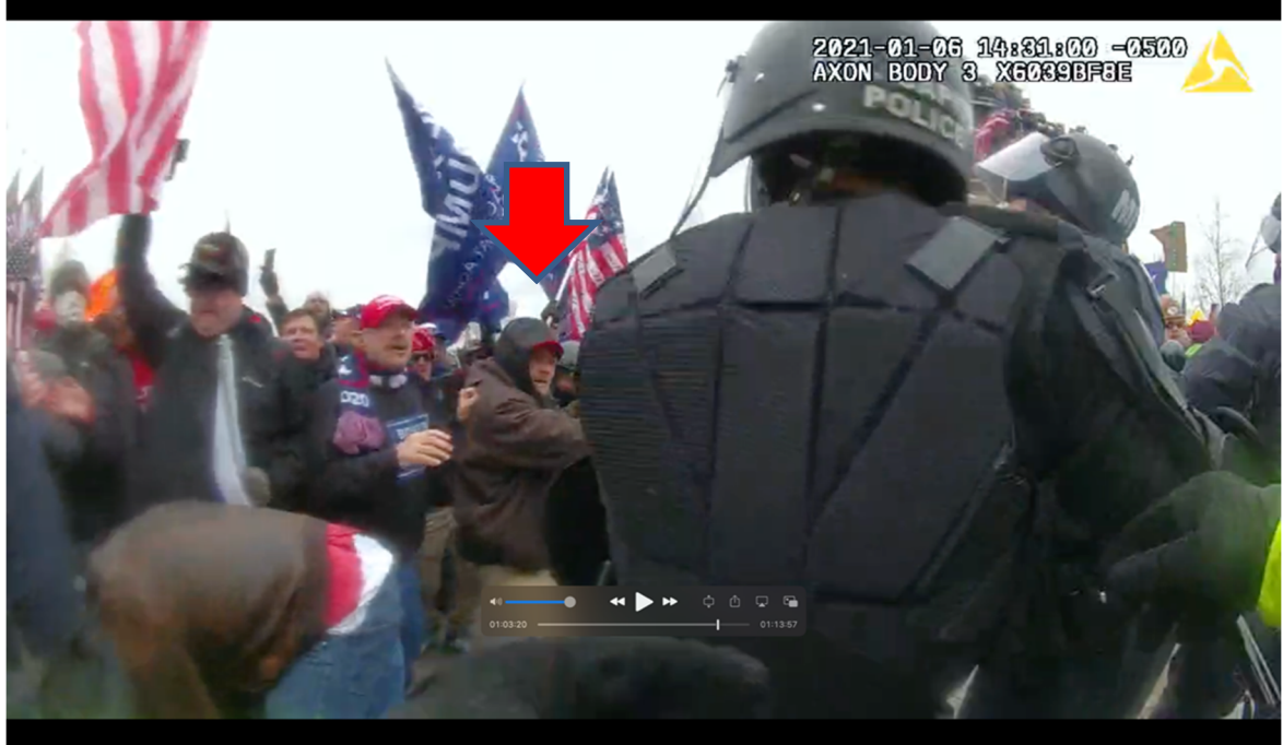
Figure 5: In this series of four still images from Exhibit 7, Sargent reached for a U.S. Capitol Police officer with his open hand and made contact with the officer. The officer's body obstructed the view of Sargent at the time he made contact, but Sargent was visible immediately thereafter.