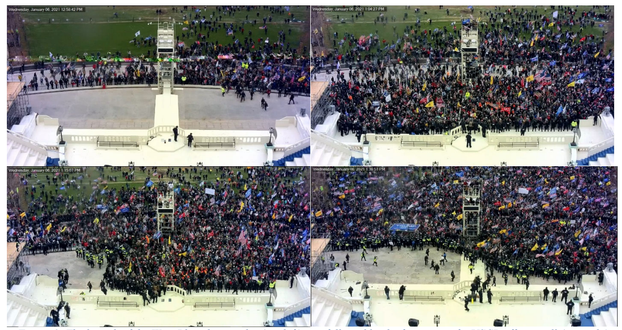
Figure 1: The breach of the West Plaza barricades (top left) was followed by the formation of a USCP officer wall (top right) until MPD officers arrived with bike rack barriers for a defensive line at the top of the West Plaza stairs (bottom left). In the photo of the nearly completed bicycle rack barrier line as of 1:39 pm, a large Trump billboard which would later be used against the police line like a battering ram is visible (bottom right). In each of these images, a media tower is visible in the center.

Following the conclusion of President Trump's speech at approximately 1:15 pm, the crowd began to grow even more rapidly, supplemented by those who had walked the mile and a half from the Ellipse to the Capitol. At 2:03 pm, Metropolitan Police Department officers responding to USCP officers' calls for help began broadcasting a dispersal order to the crowd. It began with two blaring tones, and then a 30-second announcement, which was played on a continuous loop: