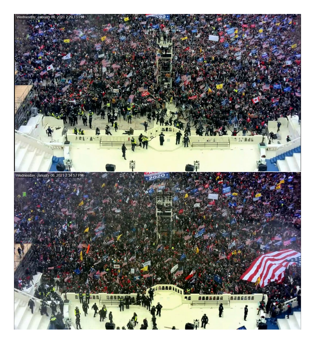
Figure 4: Breakthroughs in the defensive line on both the left and right flanks (top) caused the entire police line to collapse and individual officers were swallowed by the crowd (middle) and many officers were assaulted as they waited in a group to retreat through doors and stairwells up onto the inaugural stage (bottom).