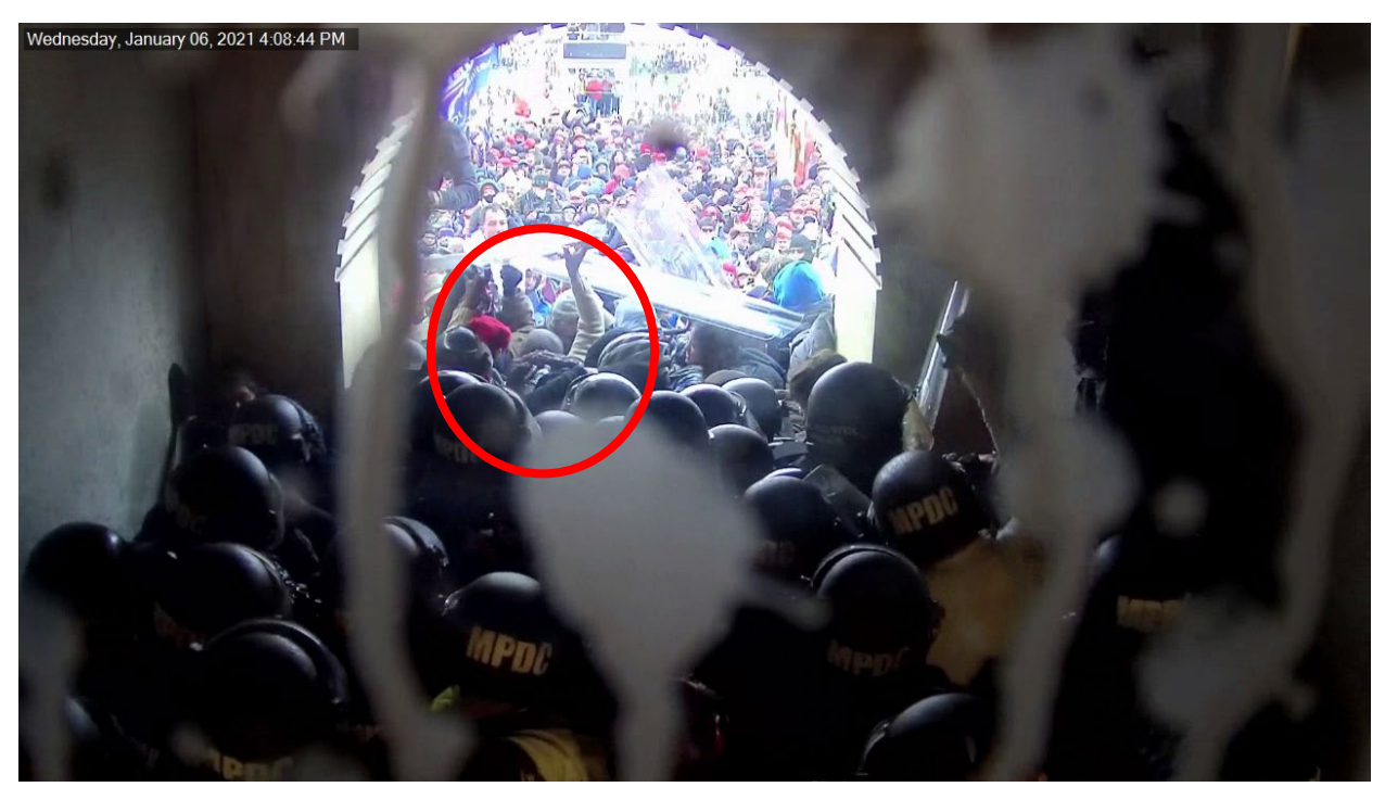
Figure 10: Ponder works with other rioters to pass a police riot shield forward.