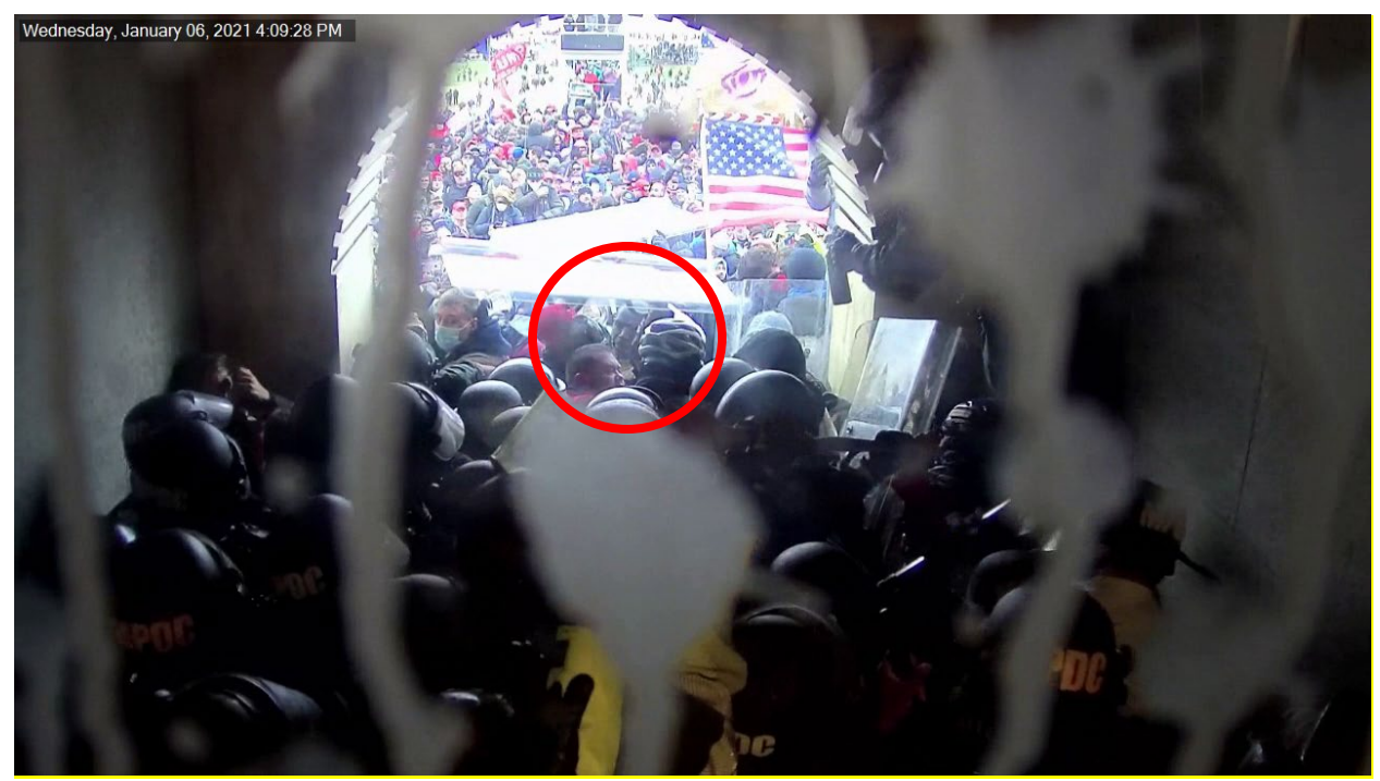
Figure 12: Ponder's face is visible under the riot shield.