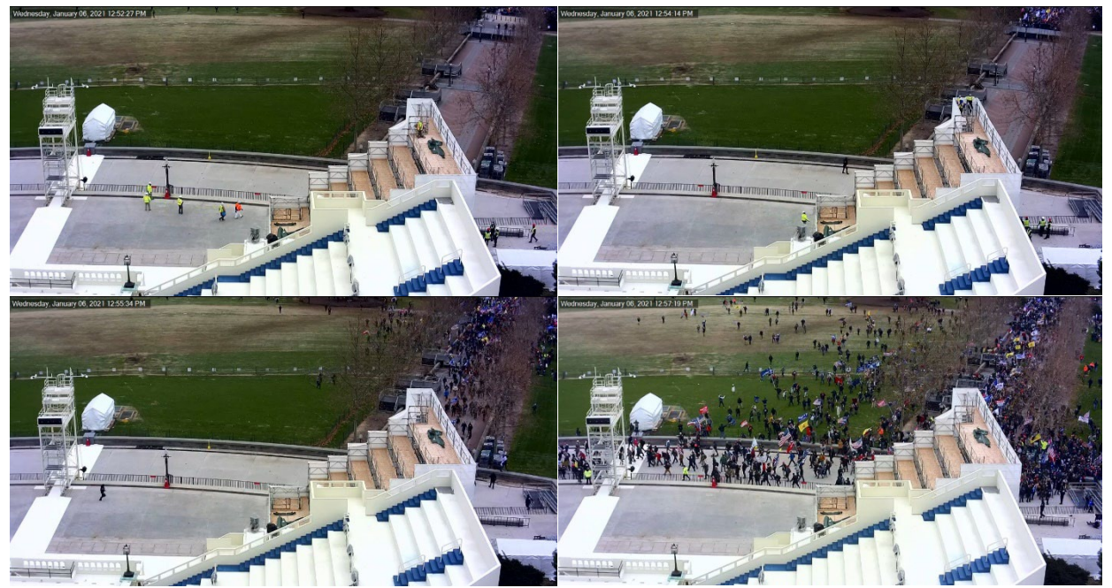
Figure 2: Stills from USCP security footage showing the progression of the crowd, from the outer barricades (top left), to the first manned police barricade (top right), to engaging with USCP at the second manned police barricade (bottom left), and beginning to fill the Lower West Plaza (bottom right).

police barrier, "Area B." They then flooded the area labeled "Lower West Plaza," "Area C," pushing against the barricade there.