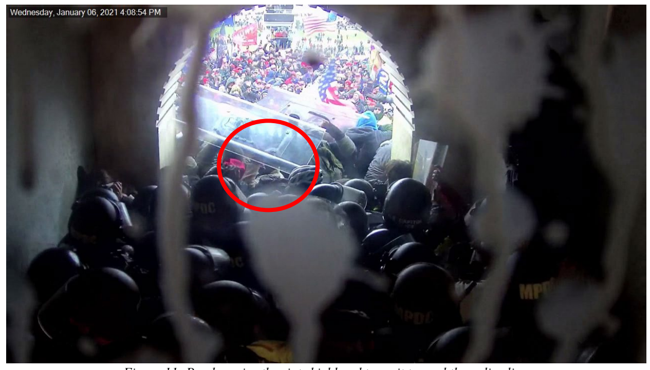
Figure 11: Ponder grips the riot shield and turns it toward the police line.