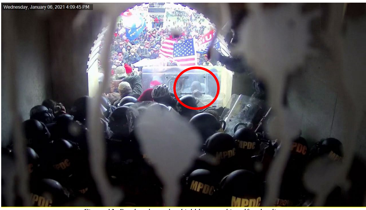
Figure 13: Ponder places the shield between himself and police.