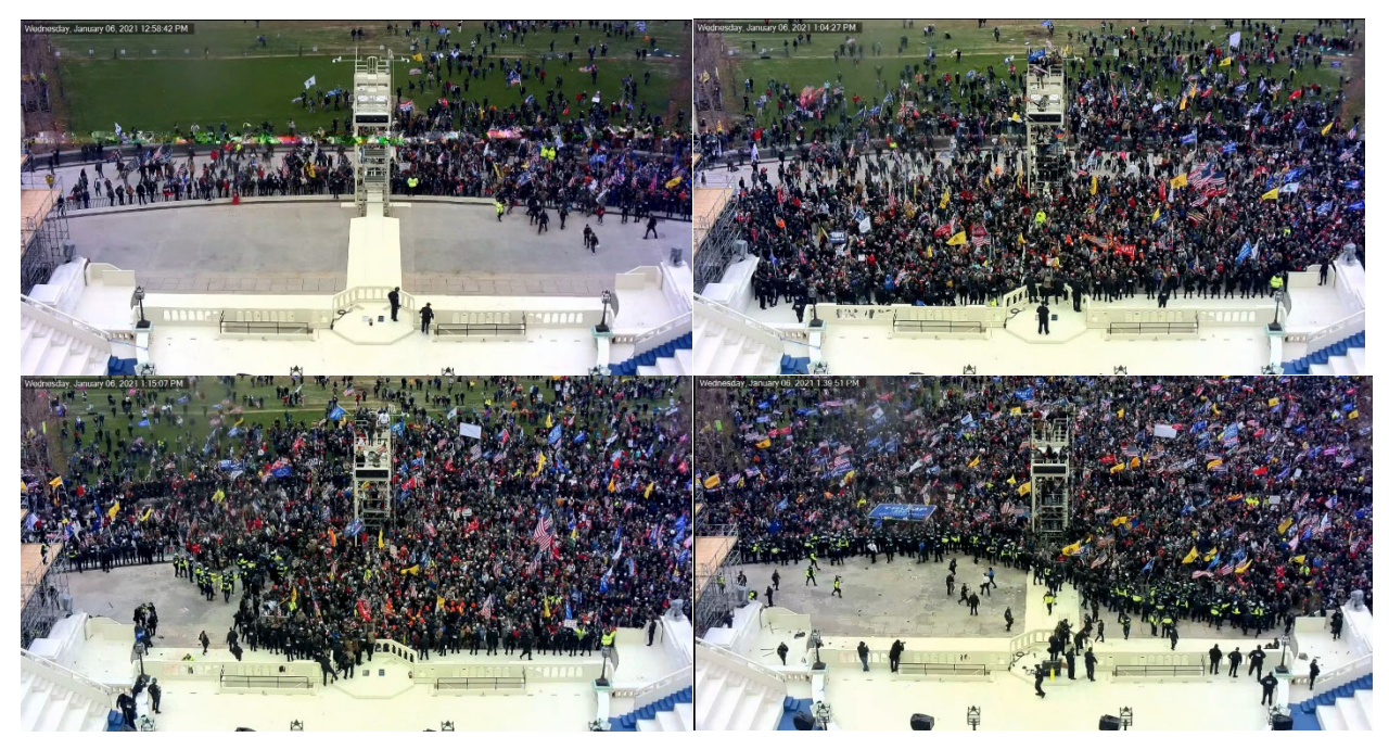
Figure 3: The breach of the West Plaza barricades (top left) was followed by the formation of a USCP officer wall (top right) until MPD officers arrived with bike rack barriers for a defensive line at the top of the West Plaza stairs (bottom left). In the photo of the nearly completed bicycle rack barrier line as of 1:39 pm, a large Trump billboard which would later be used against the police line like a battering ram is visible (bottom right).

The crowd continued to grow and, at 2:03 p.m., Metropolitan Police Department officers responding to USCP officers' calls for help began loudly broadcasting a dispersal order to the crowd. The dispersal order was clearly audible over the roar of the crowd.