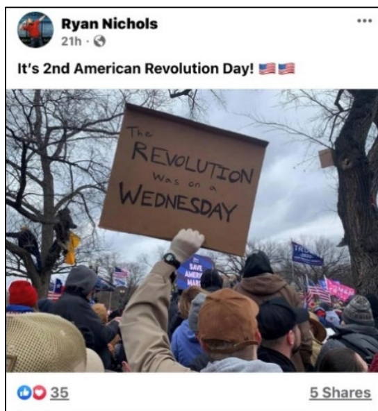
Image 2: Nichols post from the "Stop the Steal" rally of another attendee's sign, which he echoed with own caption.

While attending the rally, Nichols posted an image of another rally attendee's sign to Facebook which contained the implicit threat of violence of a coming "second revolution." See Image 2.