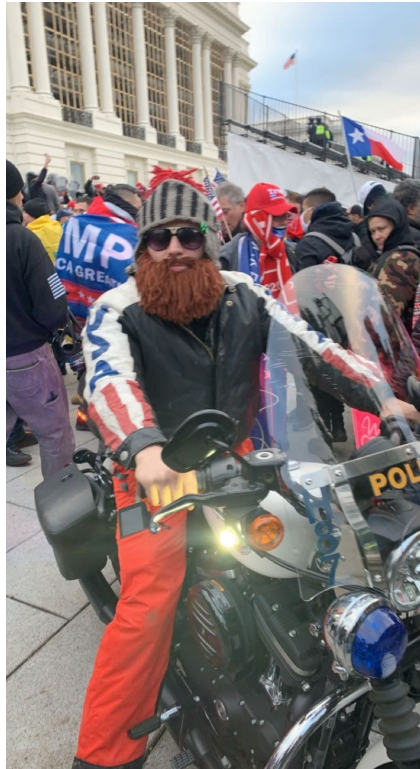
Image 4 (Trial Exhibit 505): Fellows on a U.S. Capitol Police motorcycle on the Upper West Terrace.