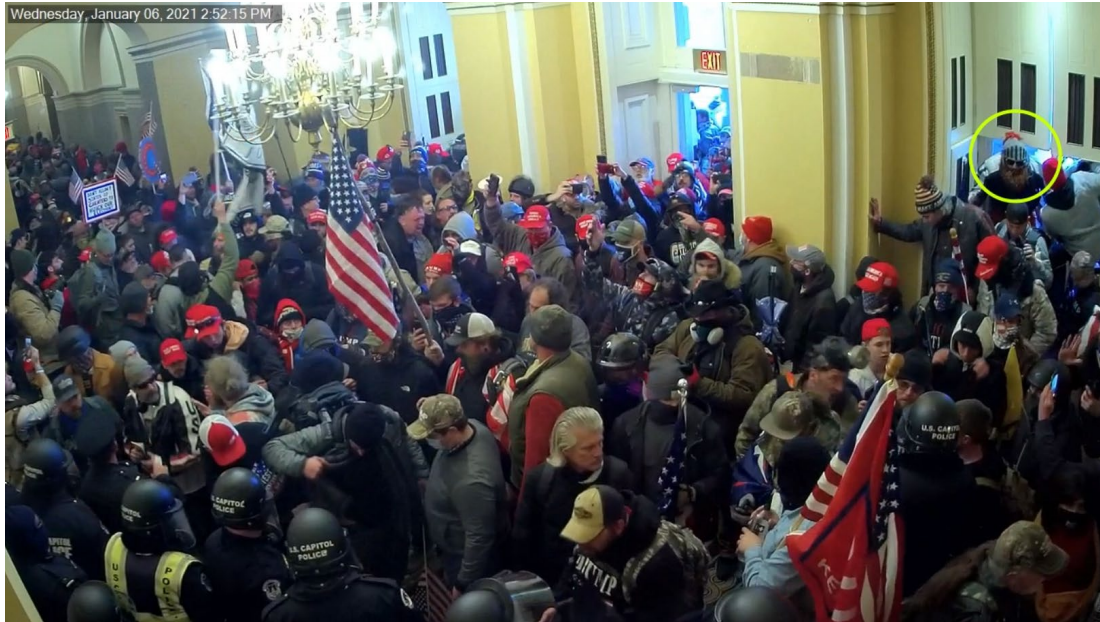
Image 1 (Screenshot from Trial Exhibit 402.1 at 00:08): Fellows entering the Capitol building at 2:52 p.m.

After he entered, he paraded through the Senate Wing Door entryway holding a “Trump 2020” flag. He stood on top of broken furniture and waved the flag, as captured in Image 2.