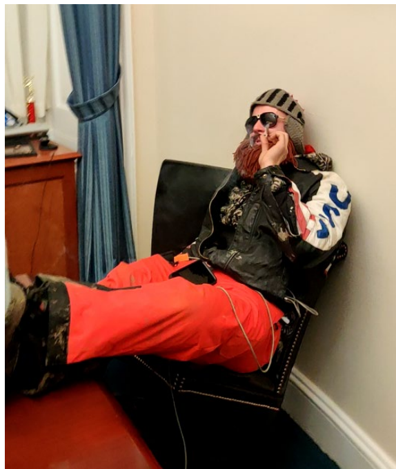
Image 3 (Screenshot from Trial Exhibit 1102 at 00:11): Fellows smoking marijuana in Senator Merkley's office.

From the entryway, Fellows briefly entered a congressional conference room, and then walked across the hall to the private office of Senator Jeff Merkley of Oregon. While inside, Fellows sat in a chair, put his feet up on a conference table, and smoked marijuana, as shown in Image 3. While inside the office, another rioter who was live streaming asked Fellows, “What is your message?” Fellows’ response demonstrated both his awareness that the rioters were not allowed into the Capitol, and his general contempt for the rule of law: “Man oh man, we got pissed. We ripped it out of the hands of these police officers,” followed by an eruption of laughter. Trial Exhibit 1101.2 at 00:35 to 01:02. Fellows stayed inside Senator Merkley’s office for approximately fifteen minutes.