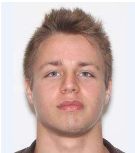
PHOTOGRAPH POSTED ON INSTAGRAM ACCOUNT: