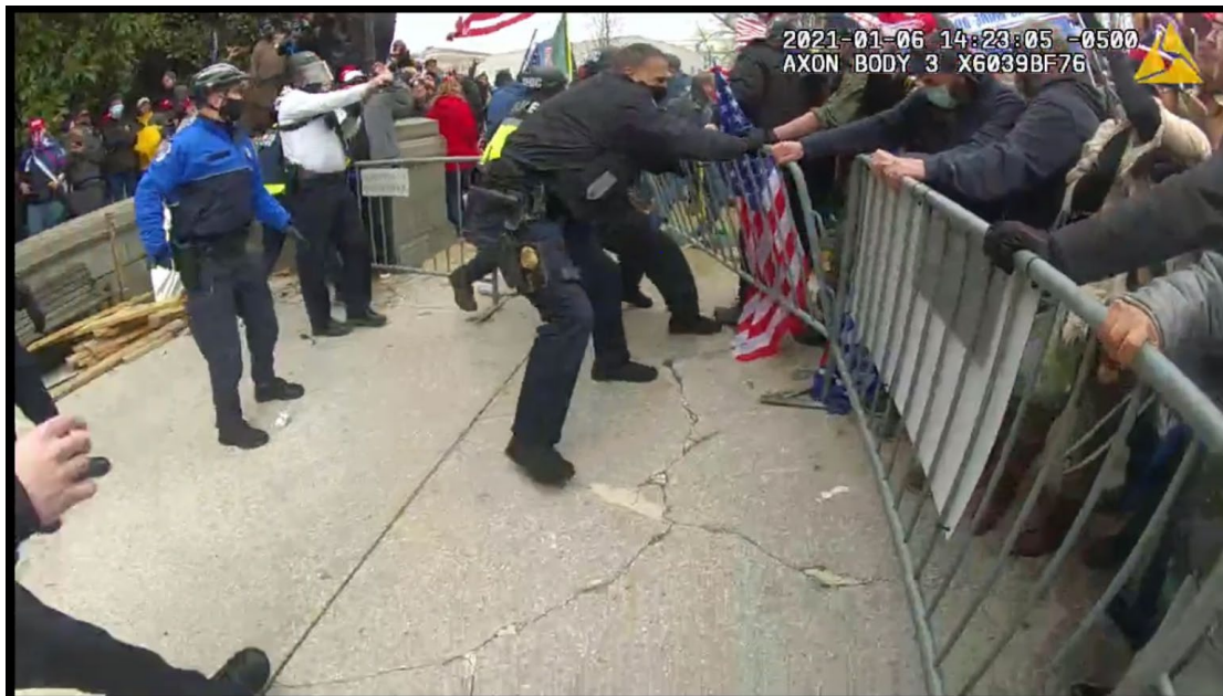
Figure 2: Screenshot from Sentencing Exhibit 002, Officer Chapman Body Worn Camera, at 2:23:05 p.m.