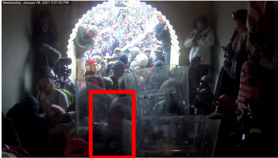
Figure 9: Screenshot from Sentencing Exhibit 005, CCV Footage at the Lower West Terrace Tunnel, at 3:07:03 p.m.