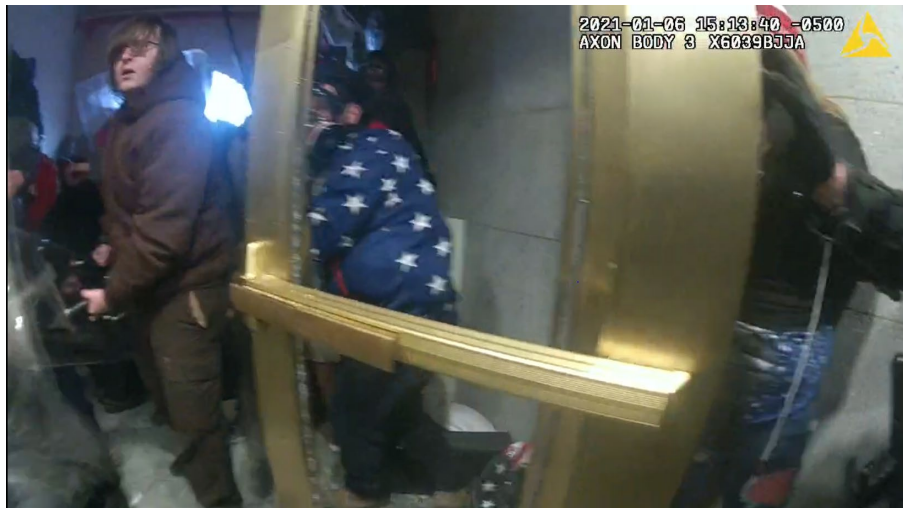
Figure 17: Screenshot from Sentencing Exhibit 010, Officer Foulds Body Worn Camera at 15:13:40.

At trial, Officer Foulds testified about the importance of holding this position at the Lower West Terrace tunnel door: