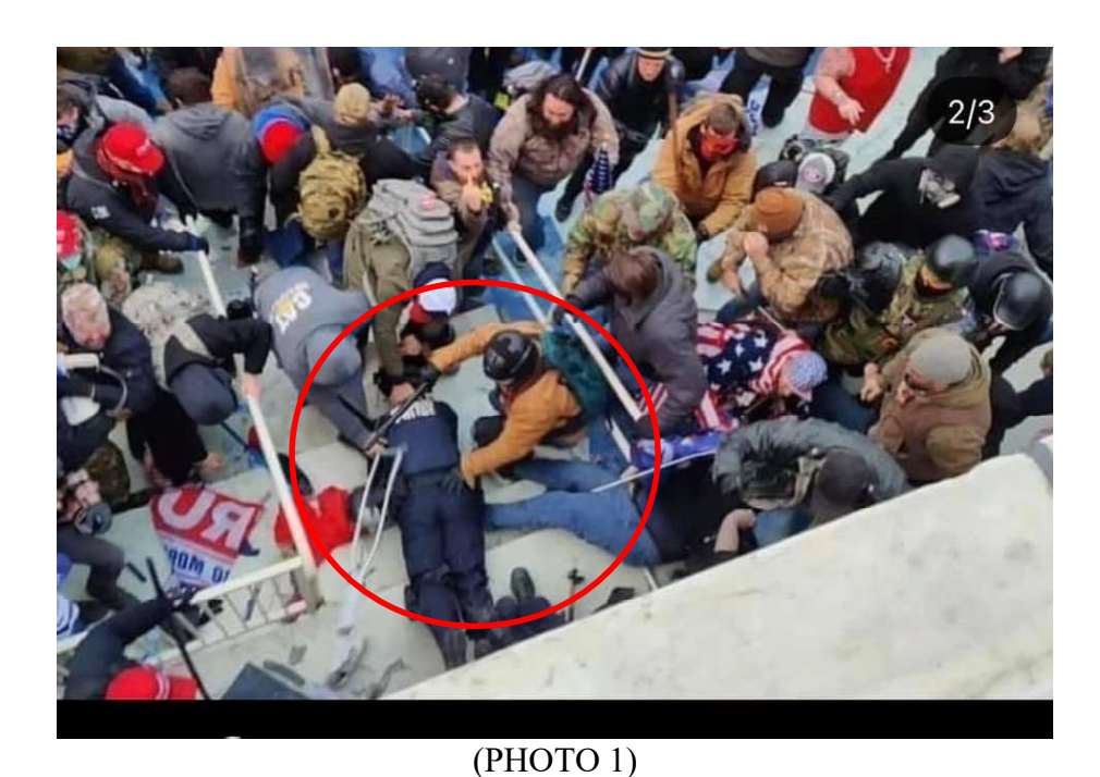
In the referenced video, the same individual that appears in the still photograph, can be seen running up the stairs of the United States Capitol and attempting to grab the leg of a presumed police officer. This individual is circled in red in the still frame from the video below. The presumed officer seems to kick the individual away from him causing the individual to fall backwards down the stairs.