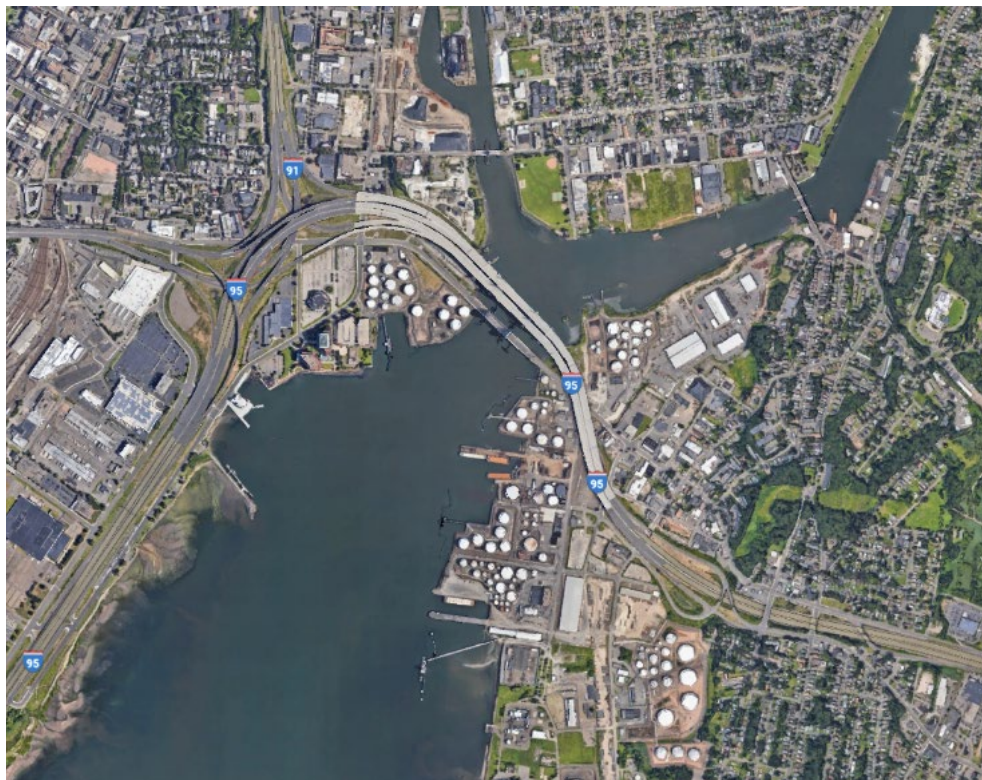
Image of New Haven, including the Quinnipiac and Mill Rivers, Google Earth (Jan. 7, 2021)

113. New Haven Harbor and the Quinnipiac River split the City of New Haven in half, with the land of the city stretching down both sides of the River and Harbor.