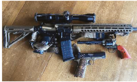
No date metadata