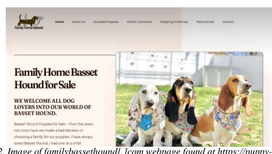
Figure 2. Image of familybassethound[.]com webpage found at https://puppy-scammerlist.us/familybassethoundhome-com, retrieved on April 8, 2022.

COOLEY LLP Attorneys at Law San Francisco