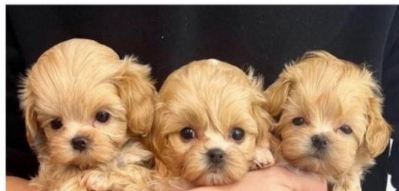
18 Figure 5. Image of maltipoofarmhome[.]com webpage, retrieved on January 5, 2022.

19 33. Defendant also ran maltipoofarmhome[.]com (Figure 5, above), a website that 20 purported to sell Maltipoo puppies for $700 and used nearly identical language to the basset 21 hound websites. The webmaster email for jerrysbassethoundhome[.]com attempted to run a 22 Google Ads campaign to promote maltipoofarmhome[.]com, which indicates common control 23 over the two sites. In late October 2021, Google suspended the Google Ads account for payment 24 fraud before any ads were served. Before it was taken down, Maltipoofarmhome[.]com was 25 hosted by Namecheap.