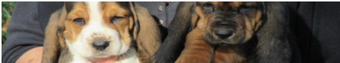
29 Figure 3. Image of jerrysbassethoundhome[.]com homepage found at 30 https://jerrysbassethoundhome[.]com/ , retrieved on April 8, 2022.

17 We are as equally dedicated to our clients as we are our dogs, being here 24/7 for phone calls, advice and support. We utilize health 18 testing in our dogs including but not limited to heart, hips, thyroid and eyes to help us better understand and TRY to eliminate genetic 19 disease.