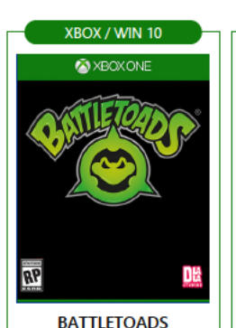
AUGUST 20, 2020