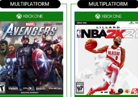
MARVEL'S AVENGERS SEPTEMBER 4, 2020