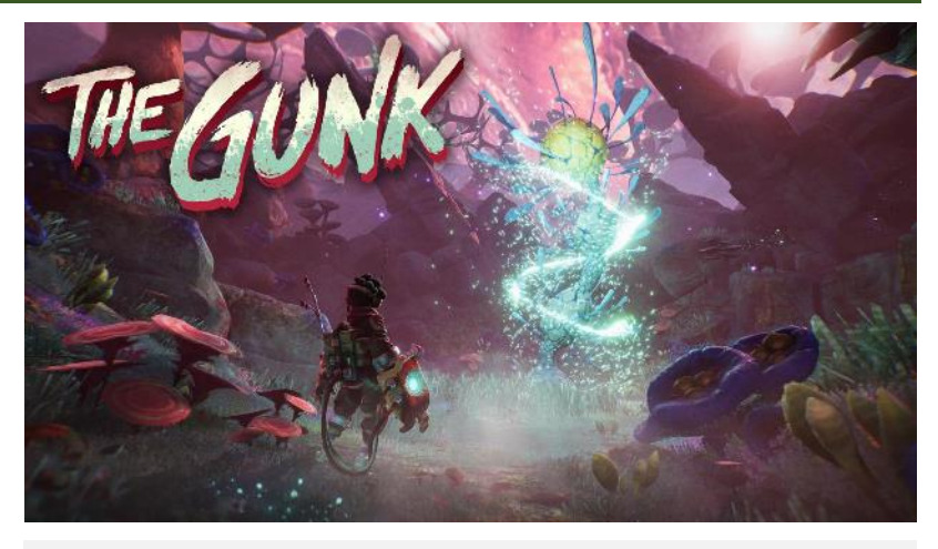
THE GUNK (Image & Form)

Game Pass Day & Date | Exclusive in Perpetuity Estimated release: O3 2021