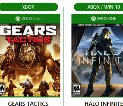
HALO INFINITE NOVEMBER 2020 NOVEMBER 2020