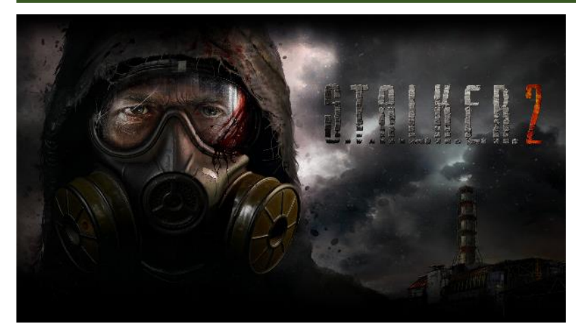
S.T.A.L.K.E.R. 2 (GSC Game World)

Game Pass Day & Date | 3 Month Console Exclusive Estimated release: Q4 2021