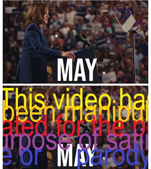
Figs. 1 & 2: A still image from Plaintiff’s video and an illustrative effort to include the mandatory labelling.

27 101. Although Plaintiff intends for his videos, like the Kamala Harris ones, to 28 constitute political parody and satire, neither AB 2655’s “satire or parody” exemptions, nor AB