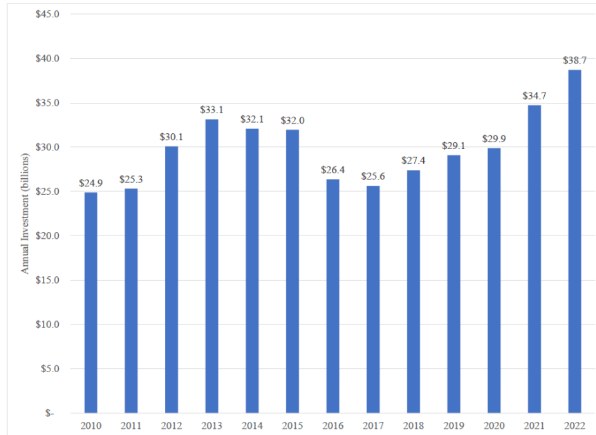
Figure 2: Mobile Wireless Investment (Annual) (2010-2022)

Source: CTIA, "CTIA's Wireless Industry Indices Report," July 2023, Table 16.