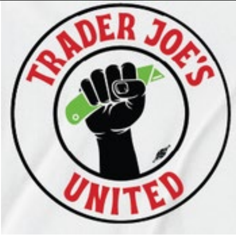
Product design: "Trader Joe's United"

1 2 3 4 5 6 7 8 9 10 11 12 13 14 15 16 17 18 19 20 21 22 23 24 25 26 27 28