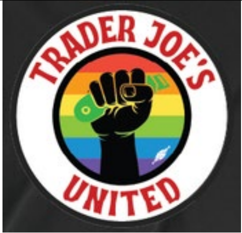
Product design: "TJU - Pride"