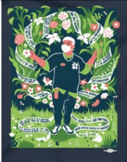
Product design: “Garland Wrapped With Pro-Union, Pro-Labor, Pro-Socialism Slogans”

1 2 3 4 5 6 7 8 9 10 11 12 13 14 15 16 17 18 19 20 21 22 23 24 25 26 27 28