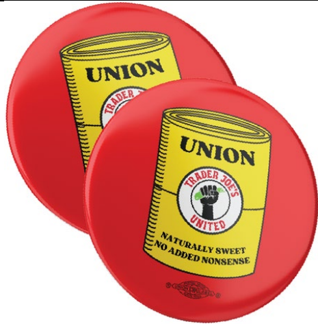
Product design: "Canned Corn"

29. For example, among other products, Defendant affixes its infringing product designs to reusable carrying bags. This infringes at least Trader Joe's Trademark Reg. No. 5,221,626, which covers "merchandise bags" in Class 16 and "[a]ll-purpose reusable carrying bags" in Class 18. A side-by-side comparison of Trader Joe's authentic product and Defendant's infringing product is shown below: