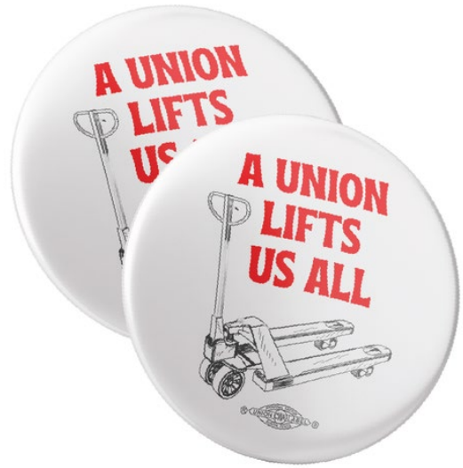
Product design: “Pallet Jack”