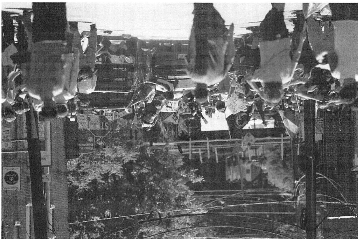
The black Antifa flag was also prominently featured in Plaintiffs' Exhibit 0291 (Red arrow added for purposes of this document to identify the flag)

And, tellingly, Plaintiffs' financiers at "Integrity First for America" conspicuously excluded this exhibit from their publicly searchable database of evidence, when they went to brag about their supposed victory in this case.