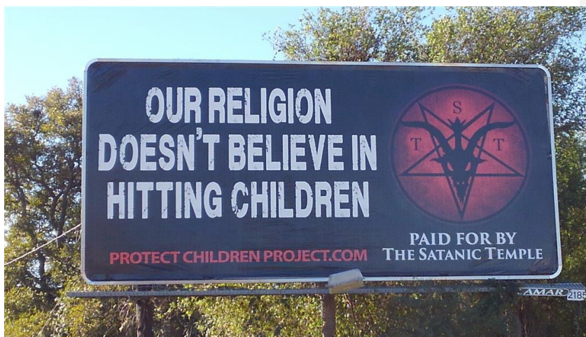
Past Design 2:

50. On September 4, 2020, at 4:00 pm (EST), Jacqueline and Tom confirmed the subject locations by email.