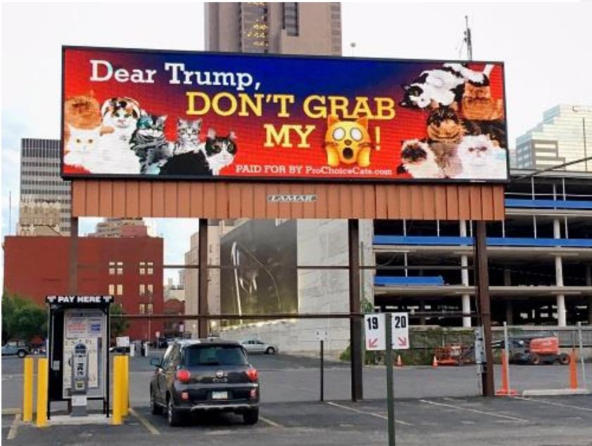
Acceptable Design 1

[remainder intentionally left blank, next design following]