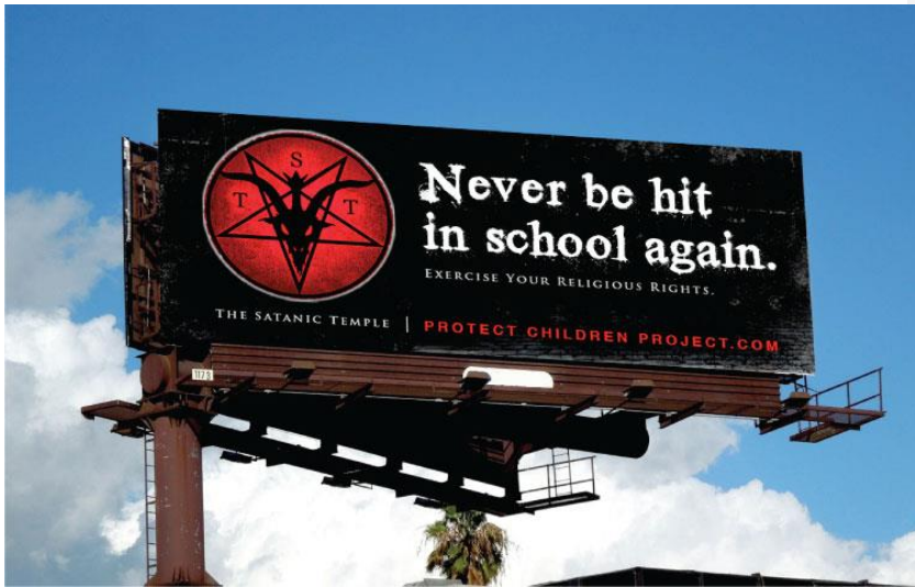
Past Design 1:

49. In that same past campaign, Lamar also posted this design: