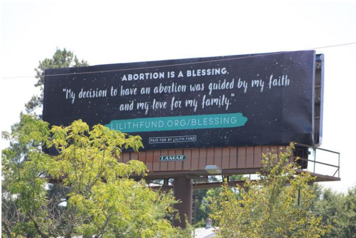
Acceptable Design 6: