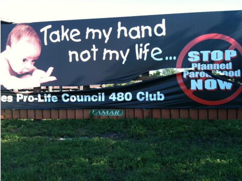
Acceptable Design 2:

[remainder intentionally left blank, next design following]