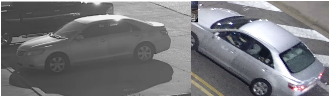
Left Image: Security Footage

Montgomery on the night of the explosion which depicted the difference in color on the rear driver's side door which was compared with a security photo of the identified vehicle from above. The comparison revealed both vehicles have the same unmatched color pattern on the rear driver's side door. This is referenced in the photographs below: