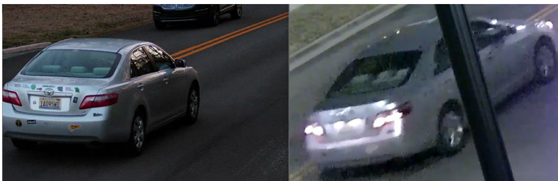
Left Photo: LPR captured image

Investigators continued to search through public and private closed-circuit television (CCTV) surveillance footage from the downtown area as well as databases of law enforcement license plate readers (LPRs), which are managed by several different law enforcement agencies throughout the State of Alabama. Investigators came across a silver 2008 Toyota Camry which was captured from an LPR located in Irondale, Alabama on February 24, 2024, at around 5:15 PM (CST). Investigators compared the shape and placement of stickers with those on the subject's vehicle from downtown Montgomery and identified several similarities as evidenced in the photographs below. Specifically, investigators noted similarities in the shape of the decal on the right rear bumper, the left rear bumper, under the right taillight, and to the right of the Toyota logo in the center. This is referenced in the photos below: