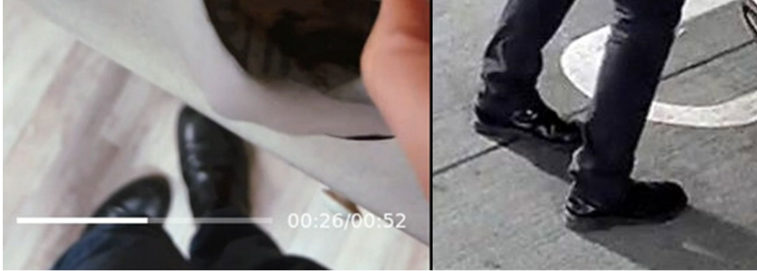
Left Image: Calvert on social media